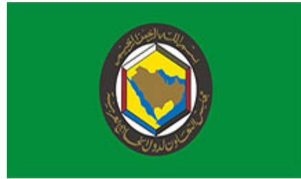
Gulf Cooperation Council—designated Hezbollah a terrorist organization on March 2, 2016. The GCC includes Bahrain, Kuwait, Oman, Qatar, Saudi Arabia, and the United Arab Emirates. 269