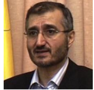
Hussein al-Khalil Top Political Adviser to Nasrallah