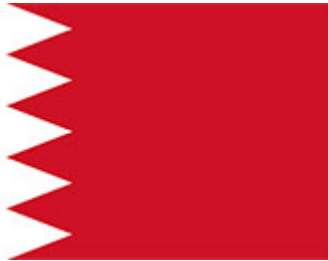
Bahrain—listed Hezbollah as a terrorist organization on April 9, 2013. 268