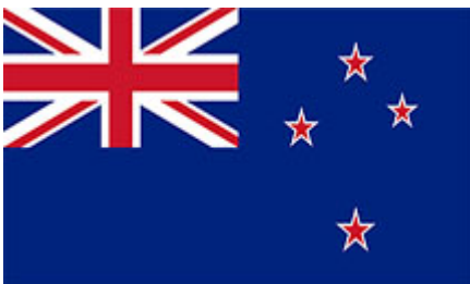
New Zealand—listed Hezbollah as a terrorist organization on February 10, 2010. 270