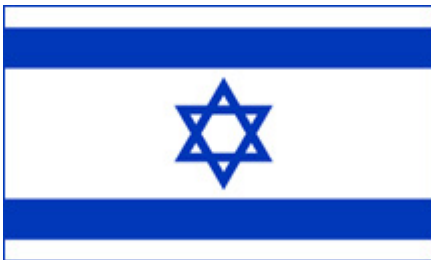
Israel—listed Hezbollah as a terrorist organization on April 11, 1996. 262