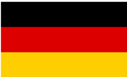
Germany—banned al-Manar on October 29, 2008. 272