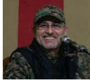
Mustafa Badreddine Military Commander (deceased)