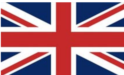
United Kingdom—banned Hezbollah’s External Security Organization on February 11, 2001, and designated its military wing as a terrorist organization in 2008. On February 25, 2019, the U.K. Home Office proscribed Hezbollah in its entirety. Both houses of Parliament approved the decision later that week. 264