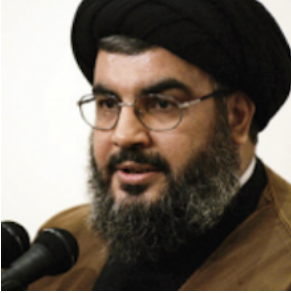
Hassan Nasrallah Secretary-General