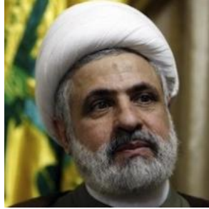
Naim Qassem Deputy Secretary-General