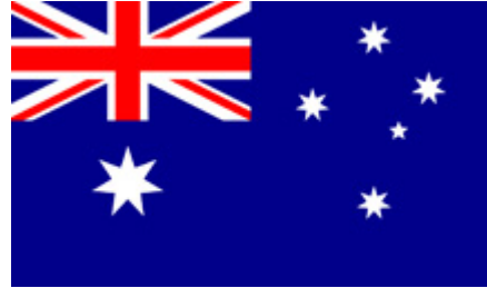
Australia—listed Hezbollah's External Security Organization as a terrorist organization on June 5, 2003. 267