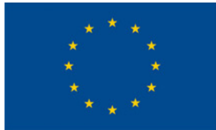
European Union—listed the Hezbollah Military Wing as a terrorist organization on July 22, 2013. 263