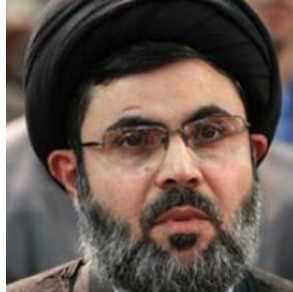
Hashem Safieddine Head of Executive Assembly