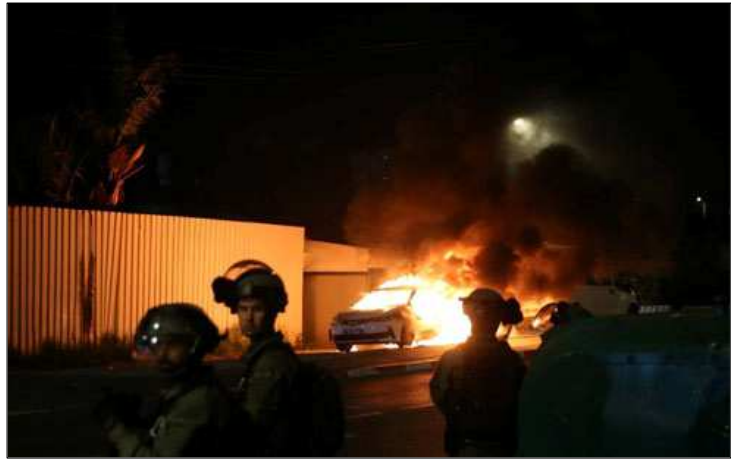
Israeli forces guard a burning car, Lod, May 12, 2021. Israeli Arabs rioted in cities considered showcases of Arab-Jewish coexistence. Hamas, Hezbollah, and the Iranian Revolutionary Guards were accused of orchestrating the violence.