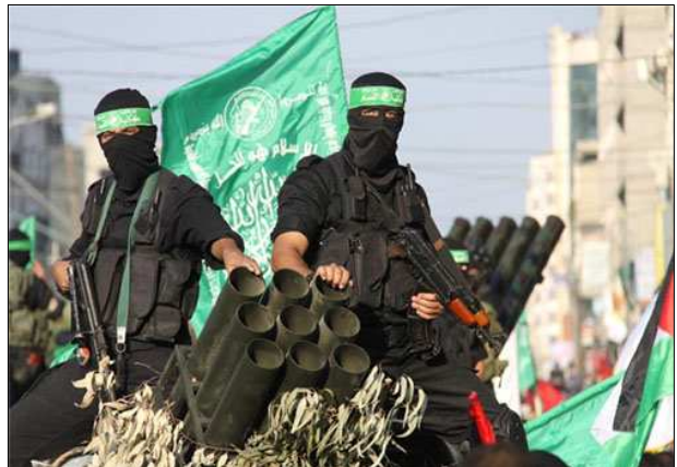
Iran has provided Hamas with arms as well as military training. In 1991, Hamas opened offices in Tehran and was invited to a conference with other Iranian clients.

The Islamic Resistance Movement, or Hamas as it is known after its Arab acronym, is the Palestinian offshoot of the Egyptian Muslim Brotherhood, with roots dating back to the late 1920s. It was founded under its current name in December 1987 during the outbreak of the Palestinian uprising in the West Bank and the Gaza Strip, or intifada, with the explicit goal of destroying the State