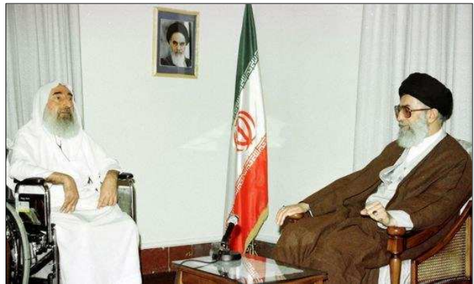
In 1998, Hamas founding leader Ahmad Yassin (left) met with Iran's supreme leader Ali Khamenei in Tehran where Yassin praised “Iran's support for the Palestinians' struggle against Israel.”

In 1998, Hamas founding leader Ahmad Yassin visited Tehran for what was effectively a state visit where he lauded “Iran's support for the Palestinians' struggle against Israel.” 11 The following year, Iranian for-