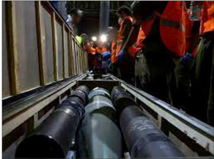
Seized missile shipment, March 5, 2014. As Hamas rockets were pounding Israel's cities and villages, an Iranian official boasted that Tehran was sending rockets and military aid to Hamas.

Velayati was not lying. Hamas's longer-range M-302 and M-75 rockets had been