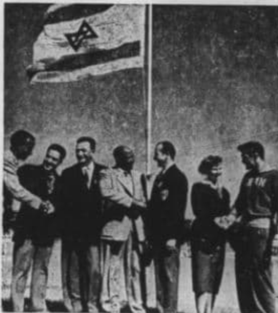
● Pictured: Israeli team members and Iranian wrestlers under the Israeli flag in the 1956 Olympic