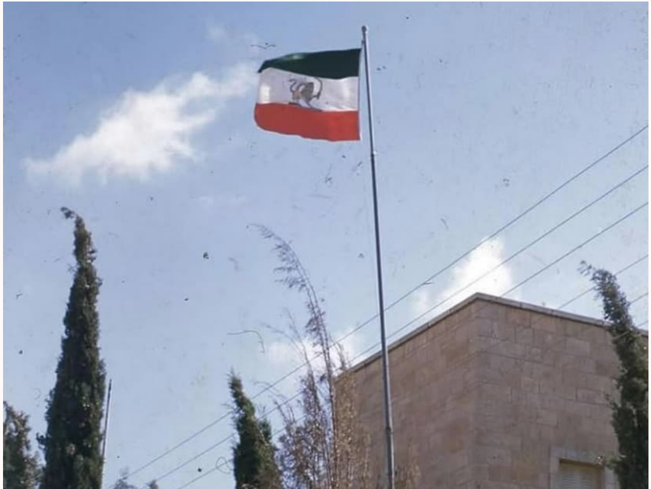
Iran's former Consulate in Jerusalem, flying the "Lion and Sun" flag used before the Islamic Revolution