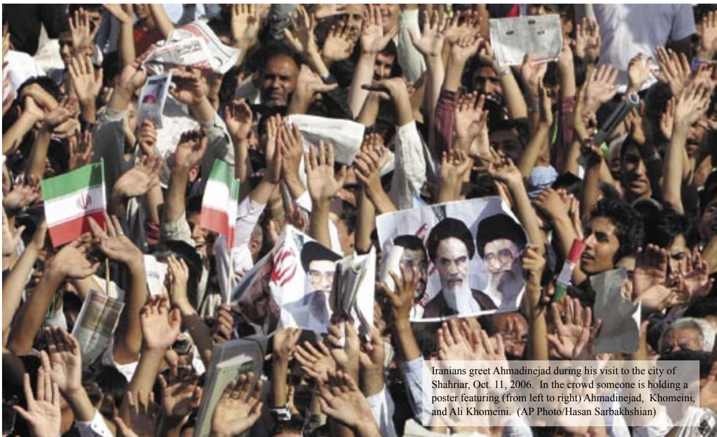
Iranians greet Ahmadinejad during his visit to the city of Shahrivar, Oct. 11, 2006. In the crowd someone is holding a poster featuring (from left to right) Ahmadinejad, Khomeini, and Ali Khomeini.