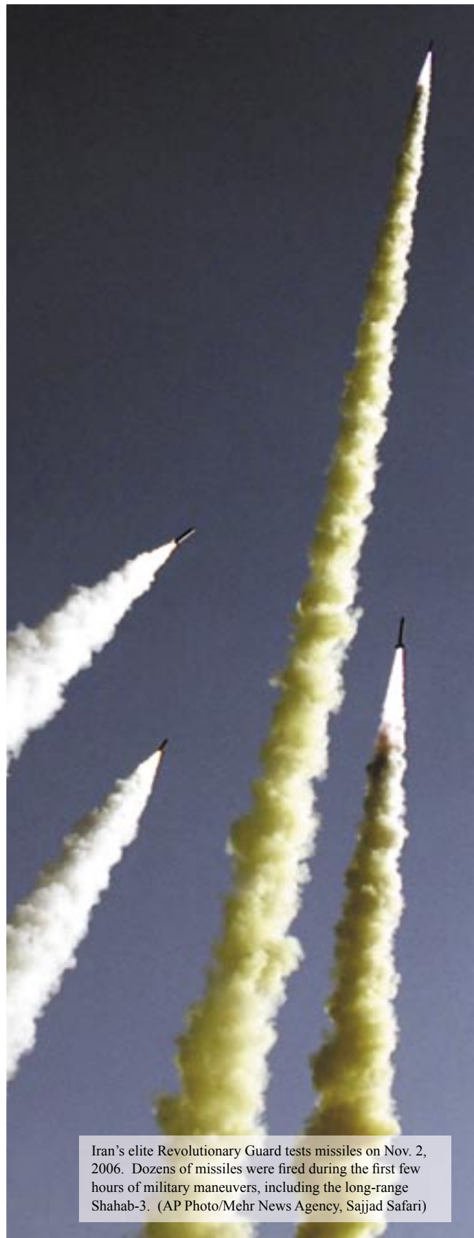
Iran's elite Revolutionary Guard tests missiles on Nov. 2, 2006. Dozens of missiles were fired during the first few hours of military maneuvers, including the long-range Shahab-3.

Genocide was the foremost cause of preventable death and suffering during the last century. 199 The new century can be much less perilous. This Monograph seeks to generate international attentiveness pertaining to Iran's violations of the requisites for U.N. membership and the central role of the Iranian President in incitement to genocide. As demonstrated supra , Ahmadinejad has repeatedly violated international treaties and customary international law pertaining to genocide. He has also, time after time, violated national laws pertaining to Holocaust denial and related hate crimes. As a consequence, there exist a multiplicity of potential prosecutors and legal venues that are available to commence legal action. Bluntly put, Ahmadinejad's incitement necessitates an indictment.