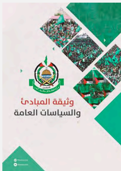
The front page of Hamas's new political document, or, to use its full name: "A Document of General Principles and Policies"