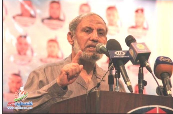
Mahmoud al-Zahar delivering an anti-Semitic speech during a ceremony commemorating operatives of the Hamas security services killed during Operation Protective Edge (Filastin Al-Aan, September 30, 2014)