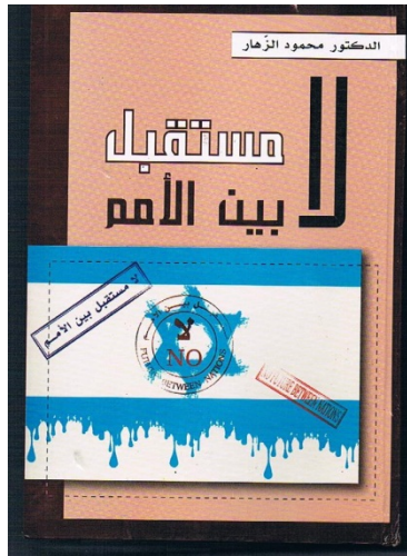
The cover of Dr. Mahmoud al-Zahar’s book “No Future [for the Jews] Between Nations” The book was found on board the Marmara.

the peoples among which they lived. Al-Zahar claims that Zionism plays a considerable role in creating the enmity towards the Jews. 7