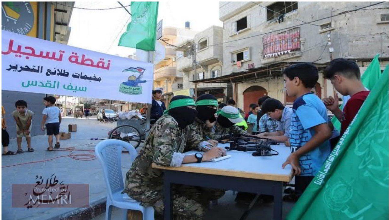
Registration booth for the "Pioneers of Liberation – Sword of Jerusalem camps"