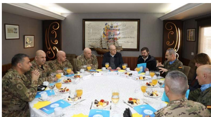
Mikati and Aoun in UNIFIL's eastern headquarters