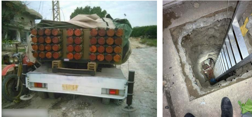
Right: Entrance to tunnel linking eight weapons storehouses (IDF spokesperson, December 22, 2024). Left: Forty tubes for rocket launchers (IDF spokesperson, December 27, 2024)

some of which were underground. During operations in the al-Naqoura area in southwest Lebanon the forces found large quantities of weapons in a pharmacy building and a truck carrying 40 rocket launchers (IDF spokesperson, December 22–30, 2024).