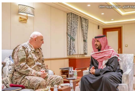
Aoun (left) meets with the Saudi Arabian defense minister (Lebanese Army X account, December 26, 2024)

► Joseph Aoun, Lebanese Army commander, visited Saudi Arabia and met with the Saudi Army Chief of Staff, Fayyad bin Hamid al-Ruwaili, and the minister of defense, Prince Khalid bin Salman. According to reports, they discussed the general situation in Lebanon, bilateral army cooperation and support for the Lebanese military institution, particularly in light of recent challenges (Lebanese Army X account, December 26, 2024).