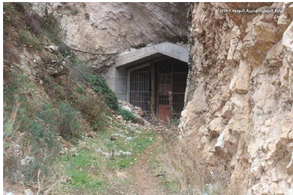
PFLP-GC post turned over to the Lebanese Army (Lebanese Army X account, December 23, 2024)

► The Lebanese Army stated that its forces continued to monitor the "Israeli violations." According to reports, "enemy forces" entered al-Qantara, Adshit, al-Qusayr and Wadi al-Hajir. After contact had been made with the ceasefire oversight committee, they withdrew from the areas and the Lebanese Army removed the blockades (Lebanese Army X account, December 22–30, 2024). "American diplomatic sources" stated that the failure to hand over Hezbollah's facilities to the Lebanese Army could lead to an extension of the 60-day ceasefire by an additional 60 days, thereby prolonging the Israeli withdrawal (Asas Media, December 27, 2024).