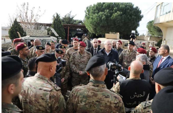
Mikati and Aoun meet with soldiers in south Lebanon (Mikati's X account, December 23, 2024)

"violations." He added that the presence of the Lebanese Army was essential for the withdrawal of Israeli forces (Lebanon24 and al-Nahar, December 23, 2024).