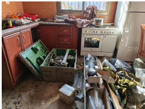
Weapons found in a civilian house in south Lebanon (IDF spokesperson, November 3, 2024). Left: Nazi memorabilia found in a house in south Lebanon (IDF spokesperson's X account, November 1, 2024)