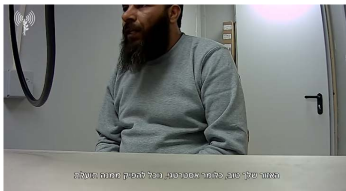
The investigation of the Iranian-affiliated terrorist operative in Syria (IDF spokesperson, November 3, 2024)