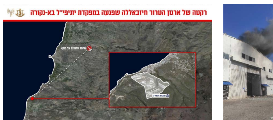
Right: The strike on the UNIFIL headquarters. Left: The trajectory of the rocket that struck the headquarters

► Najib Mikati, prime minister of the Lebanese interim government, requested Foreign Minister Bou Habib to monitor the investigation into the rocket strike on the Austrian UNIFIL battalion's headquarters. Additionally, Mikati condemned the "Israeli strike" on UNIFIL forces and praised the role the forces play in maintaining security and stability in south Lebanon (al-Nashra, October 31, 2024).