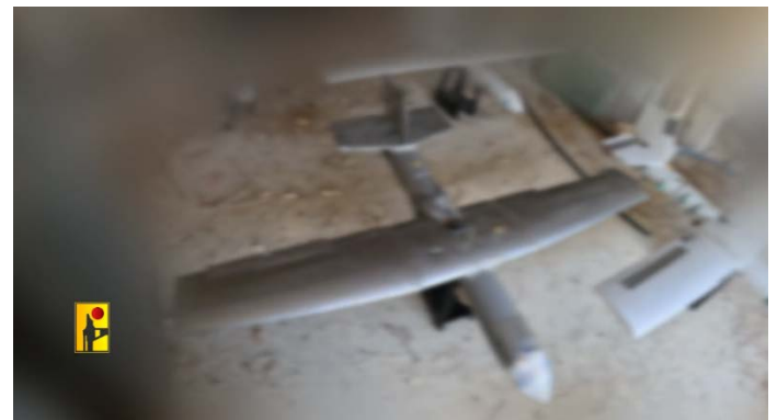
Right: A new type of UAV with an electric engine before it was launched at an IDF base. (Hezbollah combat information Telegram channel, November 3, 2024). Left: An electric-powered UAV moments before it was launched (Hezbollah combat information Telegram channel, November 3, 2024)