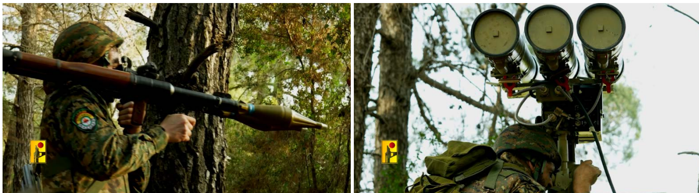
Right: A Thar-Allah launcher with three Kornet-E anti-tank missiles. (Hezbollah combat information Telegram channel, November 1, 2024). Left: A dual RPG-7 launcher. (Hezbollah combat information Telegram channel, November 1, 2024)

2024). The video showed a new anti-tank system, Thar-Allah ("the vengeance of Allah"), with three Russian-made Kornet-E missiles. There was also a dual RPG-7 launcher (Hezbollah combat information Telegram channel, November 1, 2024). In February 2024, a Hezbollah "officer" said the organization possessed a number of That-Allah anti-tank systems: Thar-Allah 1, with two launchers; Thar-Allah 2, with three launchers, and Thar-Allah 3, with four launchers (Mujtaba X account, February 27, 2024). Until that point, only the two-launcher system had been documented in use.