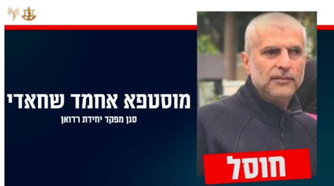
Shahadi's "ID card" (IDF spokesperson, November 2, 2024)