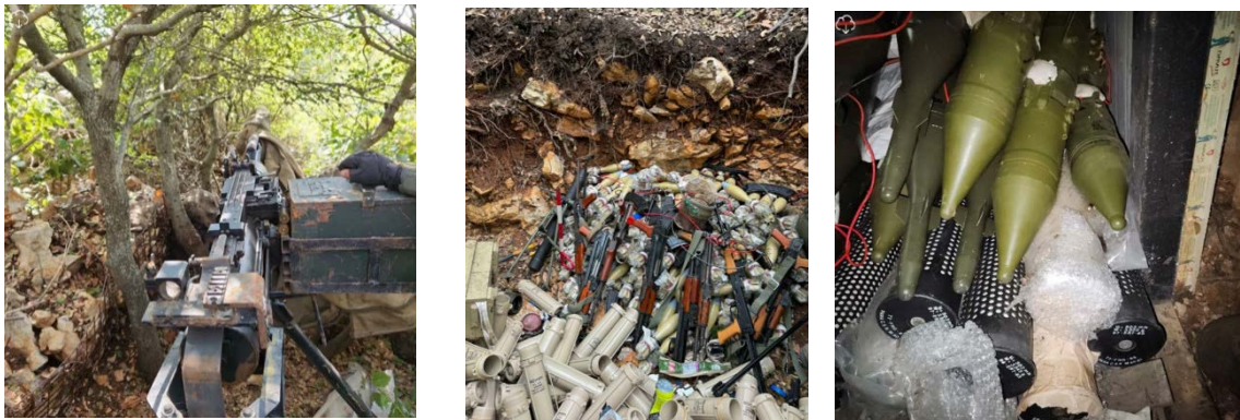
Weapons found in in the compound (IDF spokesperson, November 3, 2024)

compound was destroyed and secondary explosions indicated a large cache of weapons in the area.