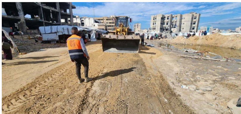
Repaving al-Thalathini Street (Facebook page of the Gaza City Municipality, December 20, 2025)

► Reconstruction work continues throughout the Strip: the Gaza City Municipality began reconstruction on Jamal Abdel Nasser Street, usually called al-Thalathini, opposite al-Azhar University in western Gaza City, after the street was destroyed during the war (Facebook page of the Gaza City Municipality, December 20, 2025).