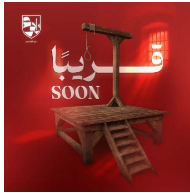
"Resistance" security notice preparing the public for the execution of "collaborators" (al-Sayyad Telegram channel, December 16, 2025)