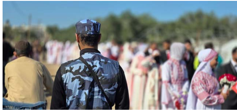
Police securing the ceremony (Facebook page of the Hamas police, December 18, 2025)

► Reconstruction work continues throughout the Strip: the Gaza City Municipality began reconstruction on Jamal Abdel Nasser Street, usually called al-Thalathini, opposite al-Azhar University in western Gaza City, after the street was destroyed during the war (Facebook page of the Gaza City Municipality, December 20, 2025).