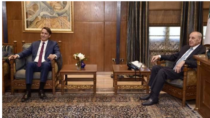
Berri and Hochstein (left) (al-Nashra, October 21, 2024)

◆ Hochstein said the meeting with Nabih Berri, the speaker of the Lebanese Parliament, had been "very constructive." At a press conference Hochstein stated that the United States was collaborating with the governments of Lebanon and Israel to "find a formula that will end the confrontation between them once and for all." He added that merely committing to Security Council Resolution 1701 was insufficient and that "tying Lebanon's fate to other conflicts is not in the Lebanese people's interest" (Reuters, October 21, 2024).