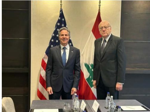
Mikati (left) and Blinken

would fully implement Resolution 1701 and allow displaced persons in both Israel and Lebanon to return to their homes (United States Department of State website, October 25, 2024).