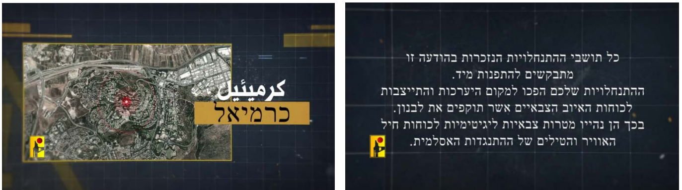
From Hezbollah's video to northern "settlers" (Hezbollah combat information Telegram channel, October 26, 2024)

► On October 26, 2024, Hezbollah released a one-minute video of 25 towns in northern Israel within 25 kilometers of the border which Hezbollah stated had not been evacuated. The video ended with a warning to residents to leave their homes "immediately" as IDF forces were [allegedly] organizing attacks against Lebanon from the locations, designating the towns as "legitimate military targets" (Hezbollah combat information Telegram channel, October 26, 2024). On October 27, 2024, Hezbollah claimed responsibility for firing rocket barrages at Kiryat Shmona and Nahariya, stating that the attacks were within the boundaries of the warning issued to several northern "settlements" (Hezbollah combat information Telegram channel, October 27, 2024).