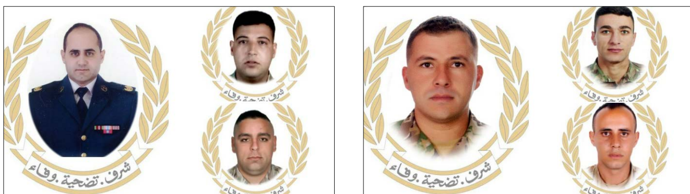
Right: The three Lebanese Army soldiers killed on October 20. Left: The three soldiers killed on October 24 (Lebanese Army X account, October 21 and 24, 2024)

► On October 23, 2024, Lebanese Army Commander Joseph Aoun met with German Foreign Minister Annalena Baerbock in Beirut. They discussed the general situation in Lebanon and ways to support the Lebanese army in facing current challenges (Lebanese Army X account, October 24, 2024).