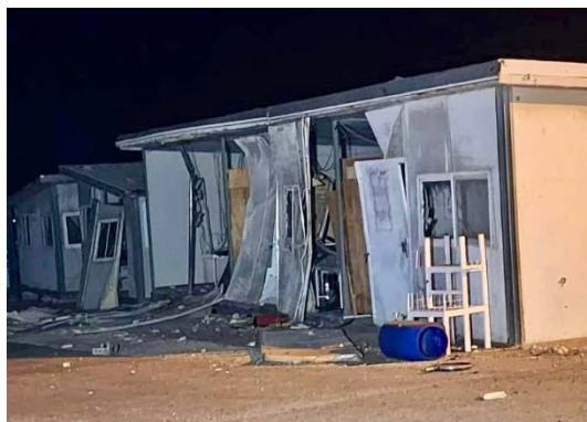
Damage to residential structures at a UNIFIL post (UNIFIL Telegram channel, October 25, 2024)