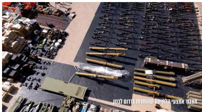
Right: Weapons discovered by IDF forces in south Lebanon (IDF spokesperson, October 24, 2024). Left: Destruction of an underground tunnel in south Lebanon (IDF spokesperson, October 19, 2024)

◆ Attacks on sites where Hezbollah stored funds: On the night of October 20, 2024, the IDF carried out dozens of airstrikes on Hezbollah headquarters and sites used to store funds for its military wing. The strikes targeted assets of the al-Qard al-Hasan Association, 2 Hezbollah's financial arm, which supplies Hezbollah the funds to purchase weapons and pay salaries to military operatives (IDF spokesperson, October 21, 2024).