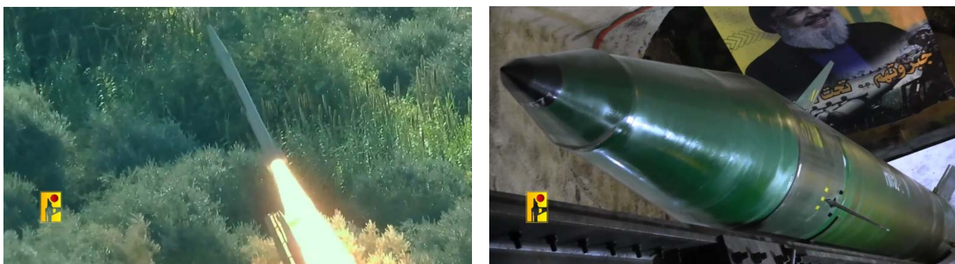
Right: Qader 2 missile moments before launch (Hezbollah combat information Telegram channel, October 23, 2024). Left: Launch of a Nasser 2 missile (Hezbollah combat information Telegram channel, October 25, 2024)

◆ New weapons: On October 16, 2024, Hezbollah announced the first use of the Qader 2 missile to attack the greater Tel Aviv area. According to a Hezbollah video, the Qader 2 is a surface-to-surface missile with a range of 250 kilometers and capable of carrying a 405 kg warhead (Hezbollah combat information Telegram channel, October 16, 2024). On October 21, 2024, Hezbollah announced the use of Nasser 2 ballistic missile to attack the city of Haifa. According to Hezbollah, the Nasser 2 is a precision surface-to-surface missile with a diameter of 302 mm, a range of 150 km and a 140 kg warhead (Hezbollah combat information Telegram channel, October 21, 2024).