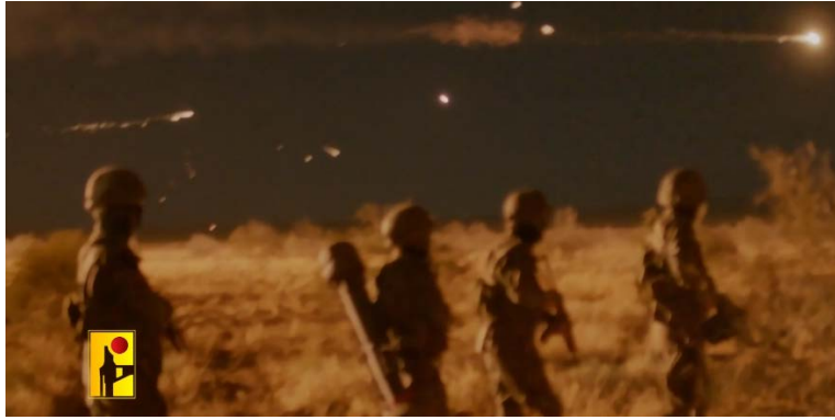
From the video "Haifa will be like Kiryat Shmona and Metula" (Hezbollah combat information Telegram channel, October 16, 2024)