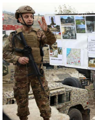
Pictures the army's tour for ambassadors and attachés ( al-Madan , December 15, 2025)

► Lebanese President Joseph Aoun rejected claims made by members of the Hezbollah faction in the Lebanese Parliament that prior to his election, he had allegedly committed in writing to adopt a "defensive strategy" toward the organization that did not include disarmament. Aoun said if such a document existed it should be published, and asked how he could have committed to such a thing when in his inaugural speech he called for concentrating all weapons in the hands of the state ( Nidaa' al-Watan , December 12, 2025).