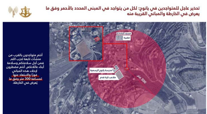
Right: Evacuation notice from the IDF spokesperson in Arabic. Left: Residents confronting Lebanese Army forces near the suspected building in the village of Yanouh