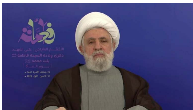
Na'im Qassem (al-Manar, December 13, 2025)

► At a conference of the organization's women's action unit, Hezbollah secretary general Na'im Qassem reiterated that "the resistance will not be disarmed." He said Hezbollah would continue to defend itself, even "if the whole world joins the war against Lebanon," claiming that the demand for disarmament was meant to weaken the organization and leave the Lebanese Army weak and helpless. He said the negotiations with Israel were useless as long as "the aggression continues," and called on the Lebanese leadership to "recalculate its course" and stop making "concessions." Qassem claimed that Lebanon's main problem was not the concentration of weapons in the hands of the state, but sanctions and internal corruption, which he said had been the result of American policy since 2019. He warned that "surrender" would lead to Lebanon's collapse and claimed that "without the resistance, 2 Lebanon would cease to exist" (al-Manar, December 13, 2025).