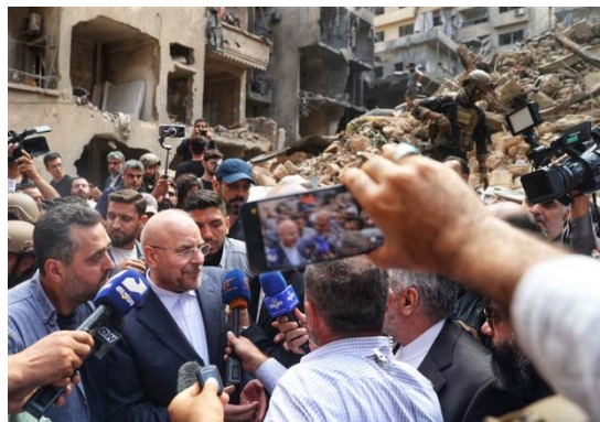
Qalibaf on a tour of the Dahiyeh