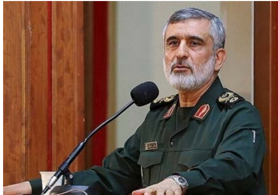
IRGC's aerospace arm commander Hajizadeh (Tasnim, October 13, 2024)

► Amir-Ali Hajizadeh, commander of the IRGC's aerospace arm, wrote in a letter sent following the Iranian attack on Israel on October 1, 2024, that the attack was "the minimum punishment for the criminal Zionist regime." He noted that the operation was fully supported by all the country's senior officials and approved by the Supreme National Security Council, with the support of the president and the commander of the armed forces. Hajizadeh added that members of the IRGC's aerospace arm and the other Iranian armed forces were on high alert and ready to respond decisively to any mistake by the enemy (Tasnim, October 13, 2024).