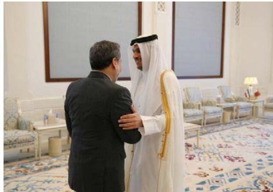
The meeting of the foreign ministers of Iran and Qatar (ISNA, October 10, 2024)