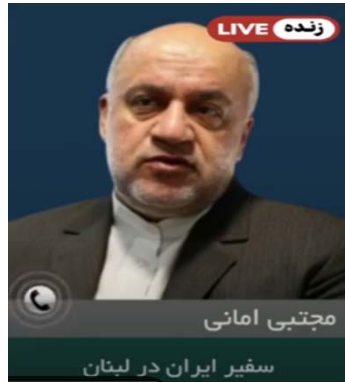
The Iranian ambassador to Lebanon (Iranian TV, October 10, 2024)

► The IRGC announced that the body of IRGC’s Qods Force Lebanese Corps commander Abbas Nilforoushan had been recovered. Nilforoushan was killed in the Israeli Air Force airstrike against Hezbollah headquarters in Beirut’s Dahiyeh on September 27, 2024, in which Hezbollah secretary-general Hassan Nasrallah was also killed. According to the IRGC announcement, his body will be transferred to Iran for burial (ISNA, October 11, 2024). The reception ceremony for Nilforoushan’s body at Tehran’s Mehrabad Airport was attended by Qods Force commander Esmail Qaani after he did not appear in public for more than ten days amid reports of his disappearance (Tasnim, October 15, 2024).