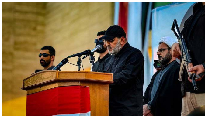
Right: Al-Wala'i speaking at the rally (Almoqawm X account, October 11, 2024).