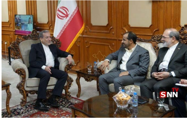
The Iranian foreign minister meets with the Houthi spokesman in Yemen (snn.ir, October 14, 2024)

► At the end of his visit to Iraq, Foreign Minister Araghchi continued to Oman. During the visit, the minister met with his Omani counterpart, Badr bin Hamad Al Busaidi, and discussed regional developments with him. Araghchi also met in Muscat with Yemeni Houthi spokesman Mohammed Abdulsalam (snn.ir, October 14, 2024).