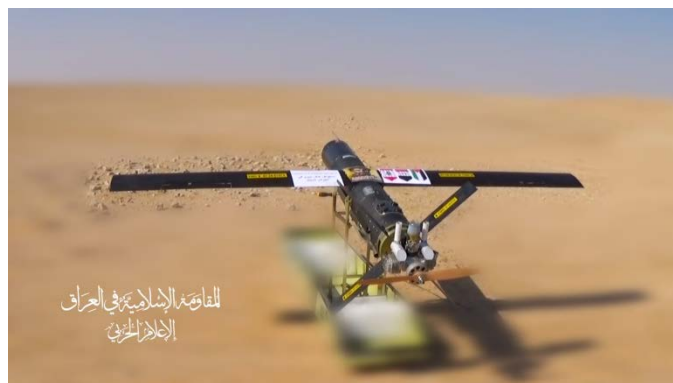
Drone being launched at the Golan Heights with a picture of Nasrallah and the flags of Iraq, Lebanon, and “Palestine” (Islamic Resistance in Iraq Telegram channel, October 10, 2024)

► This past week, the Islamic Resistance in Iraq issued 14 claims of responsibility for 15 drone attacks against targets in Israel. The claim of responsibility for an attack against “a vital target in the eastern part of the occupied lands” asserted that it was carried out by an “aircraft with developed capabilities” but no details were provided (Islamic Resistance in Iraq Telegram channel, October 9-15, 2024). The IDF Spokesperson reported that three drones heading towards Israel from the east were intercepted on two separate occasions (IDF Spokesperson, October 9-15, 2024).