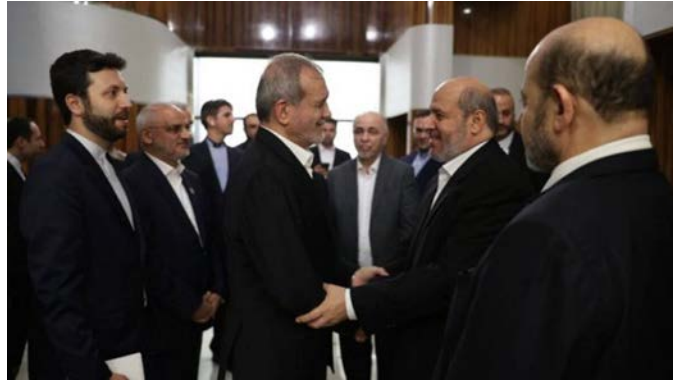
The president of Iran meets with senior Hamas figures (IRNA, October 3, 2024)