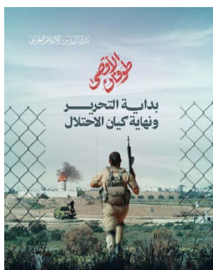
Notice issued by the PIJ's military wing. The Arabic reads, "Operation al-Aqsa Flood: the beginning of liberation and the end of the occupation entity" (Jerusalem Brigades' Telegram channel, October 7, 2024)