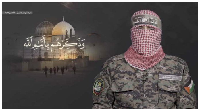
Abu Obeida marks the anniversary of October 7 (Abu Obeida's Telegram channel, October 7, 2024)