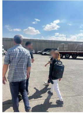
The Yazidi woman at the time of her release