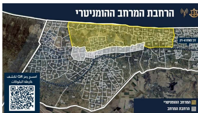
Right: Map of the enlarged humanitarian area. Left: Residents leave the Jebalya refugee camp

► Central Gaza Strip: The IDF spokesperson reported that over the past three months IDF forces killed more than 450 terrorist operatives in airstrikes and clashes. In addition, hundreds of terrorist facilities were destroyed and about eight kilometers (about five miles) of tunnels were destroyed (IDF spokesperson, October 3, 2024).