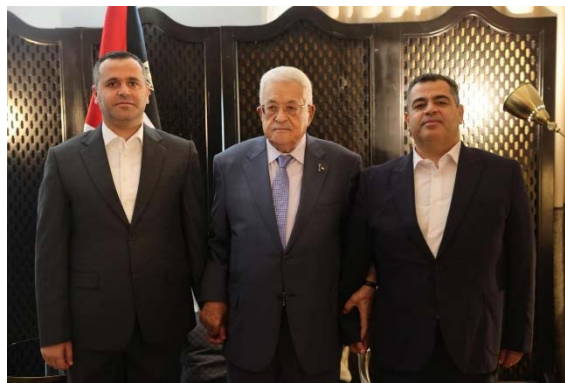
Mahmoud Abbas and the sons of Isma'il Haniyeh

►While in Doha, Mahmoud Abbas met with the sons of Isma'il Haniyeh, former head of Hamas' political bureau, who was killed on August 31, 2024. He offered his condolences to the family and noted Haniyeh's "contribution" to the Palestinian "national struggle." He said that the Palestinian people would continue to strive for their legitimate rights to freedom and independence, despite the "crimes of the Israeli occupation," and noted the unity of the Palestinian people in their struggle to establish an independent state with East Jerusalem as its capital (Wafa, October 2, 2024).