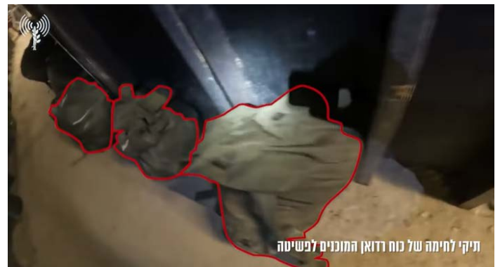
תיקי לחימה של כוח רדואן המוכנים לפשיטה