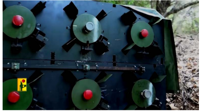
Six Fadi-4 heavy rockets about to be launched at "Mossad headquarters" (Hezbollah combat information Telegram channel, October 3, 2024)