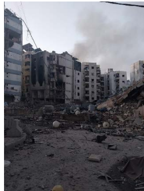
The scene of the attack in Beirut

► On the night of October 3, 2024, the Israeli Air Force attacked Hezbollah's main intelligence headquarters in the Dahiyeh al-Janoubia (IDF spokesperson, October 4, 2024). According to reports, Hashem Safi al-Din, head of Hezbollah's Central Council and considered Nasrallah's successor, was believed to be at the scene of the attack (Sky News in Arabic and Israeli media, October 4, 2024).