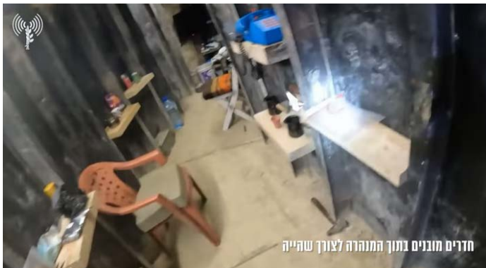
חדרים חבויים בתוך המנהרה לצורך שהייה

► On October 1, 2024, the IDF spokesperson reported that since the start of hostilities on October 8, 2023, IDF forces had carried out targeted operations in south Lebanon, exposing Hezbollah's underground facilities and the weapons which Hezbollah planned to use to invade and occupy the Galilee (IDF spokesperson, October 1, 2024).