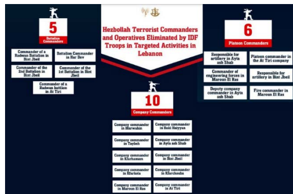
Officers in Hezbollah's field ranks who have been killed since the beginning of the maneuver in south Lebanon (IDF spokesperson, October 4, 2024)