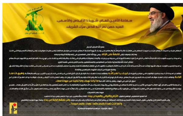
Hezbollah operatives write to Nasrallah (Hezbollah combat information Telegram channel, October 1, 2024)

► On October 1, 2024, Hezbollah published a message from the organization's operatives to "His highness, the holy and exalted shaheed," Hassan Nasrallah, who was killed in an Israeli attack on September 27, 2024. They thanked him for giving them the "blessing of the jihad" and leading them "from victory to victory." They called, "For you, oh Nasrallah" and declared that "from the borders of Palestine, on whose path you marched as a shaheed, and from the sites of Islamic resistance throughout the homeland, we will continue our journey and continue to fulfill our promise until our hopes and your goals have been attained, no matter how great the sacrifices." They addressed the "arrogant enemy" [Israel] and threatened "you will meet us as skilled snipers, from places where you expect us and from places where you do not." The soldiers signed the letter with the words: "Your faithful sons" (Hezbollah combat information Telegram channel, October 1, 2024).