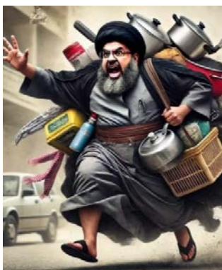
Cartoon of Nasrallah fleeing the battlefield (Sami al-Murshed's X account, September 25, 2024)