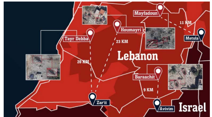
Right: Weapons discovered in a civilian structures attacked in south Lebanon. Left: Remains of an Iranian Fattah-110 missile, destroyed in the airstrikes in Lebanon

► During the operation, the Israeli Air Force attacked the Dahiyeh al-Janoubia in Beirut twice, targeting senior Hezbollah figures: