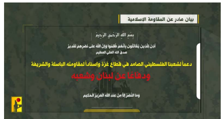
Right: Explanation for the new version. Left: The new version (Hezbollah combat information Telegram channel, September 23-24, 2024)