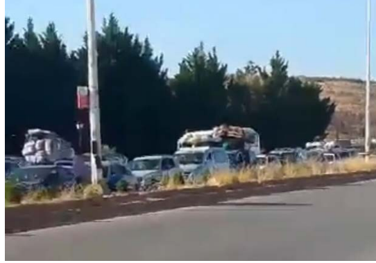
Convoys of vehicles from Lebanon near a border crossing in preparation for their entry into Syria (al-Suwaydaa September 24, 25, 2024)

► "One of the organizers" at the shelter for displaced persons in Iqlim al-Kharrub in Mount Lebanon, south of Beirut, said Hezbollah was active in the displaced persons' centers, along with other political parties. He said Hezbollah operatives distributed aid and rooms, but also prevented unauthorized access to the centers (al-Sharq al-Awsat, September 26, 2024).