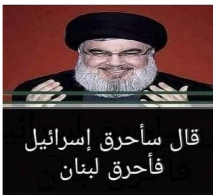
Nasrallah with a caption reading, "He said, 'I will burn Israel' and in the end he burned Lebanon"