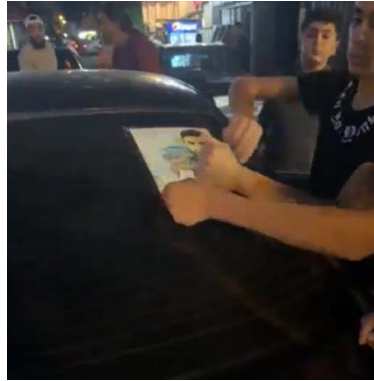
Lebanese Sunnis remove a sticker with a picture of a Hezbollah operative from the rear window of displaced Shi'ites from south Lebanon (Voice of Lebanon X account, September 25, 2024)

the Dahiye al-Janoubia remove photos of Hassan Nasrallah and Hezbollah members (X account of the Voice of Lebanon, September 25, 2024).