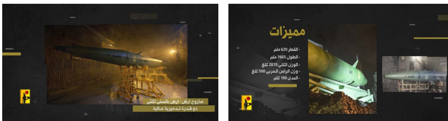
Hezbollah's Qader-1 surface-to-surface ballistic missile (Hezbollah combat information Telegram channel, September 25, 2024).