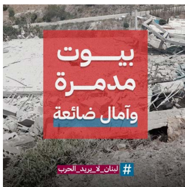
Anti-Hezbollah notice (Raymond Hakim's X account, September 26, 2024)