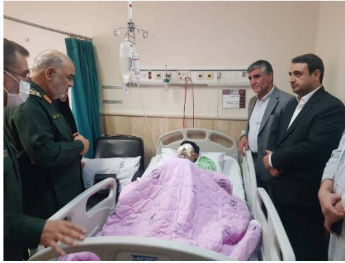
IRGC commander Hossein Salami visits wounded Lebanese in Iran (Khabar Online, September 19, 2024)