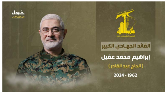
Hezbollah's announcement of the death of Ibrahim Aqil (Hezbollah combat information Telegram channel, September 20, 2024)

►Hezbollah issued videos and photos of Aqil documenting his activity in the organization. He was photographed with Hassan Nasrallah, secretary general of Hezbollah, and Qassem Soleimani, commander of the Iranian Revolutionary Guards Corps' Qods Force, who was killed in an American attack in January 2020 (Hezbollah combat information Telegram channel, 2024).