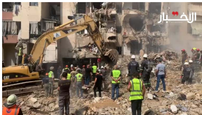
The scene of the attack in the Dahiyeh al-Janoubia in Beirut (al-Akhbar, September 21, 2024)

► On September 20, 2024, at around 4:00 p.m. in the afternoon, the Israeli Air Force struck the Dahiyeh al-Janoubia, the southern suburb of Beirut (al-Mayadeen, September 20, 2024). According to the most recent information from the Lebanese ministry of health (September 22, 2024, as of 4:00 p.m.), 50 people were killed in the airstrike and operations to clear the rubble continue (al-Nashra , September 21, 2024).