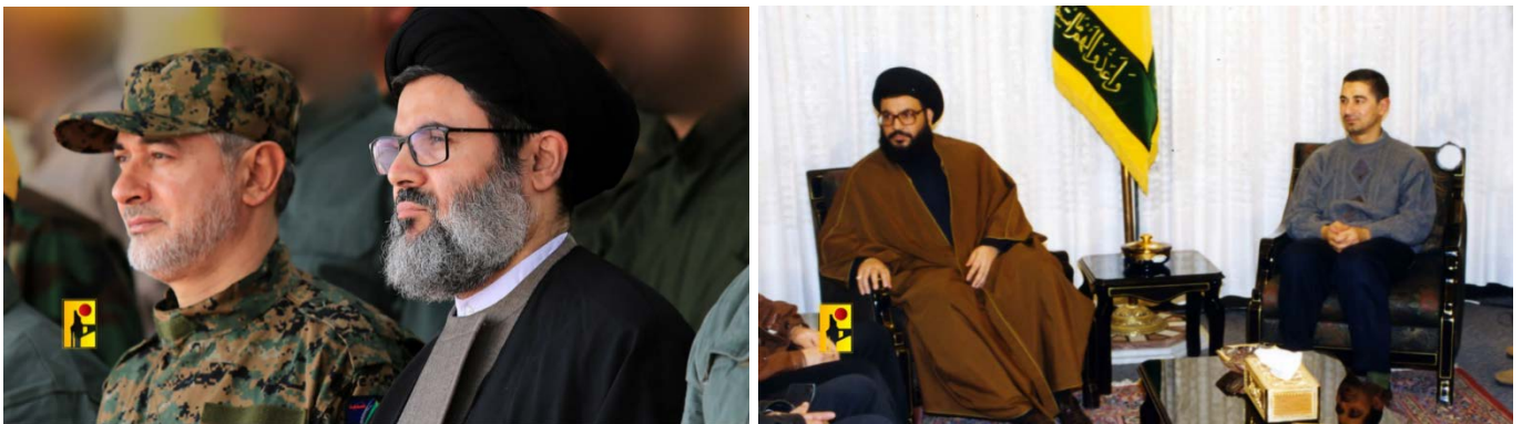
Right: Aqil with Nasrallah (an old photo). Left: Aqil with Hashem Safi al-Din (Hezbollah combat information Telegram channel, September 21, 2024)

►Hezbollah issued videos and photos of Aqil documenting his activity in the organization. He was photographed with Hassan Nasrallah, secretary general of Hezbollah, and Qassem Soleimani, commander of the Iranian Revolutionary Guards Corps' Qods Force, who was killed in an American attack in January 2020 (Hezbollah combat information Telegram channel, 2024).