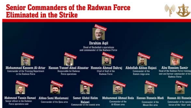
Radwan Force commanders killed in the airstrike in Beirut (IDF spokesperson, September 21, 2024)

the Radwan Force terrorist raids into Israeli territory (IDF spokesperson, September 21, 2024). A "source close to Hezbollah" also claimed that Aqil met with senior Radwan Force operatives to plan a ground military operation inside Israel in retaliation for the walkie-talkie explosions in Lebanon (Agence France-Presse, September 22, 2024).