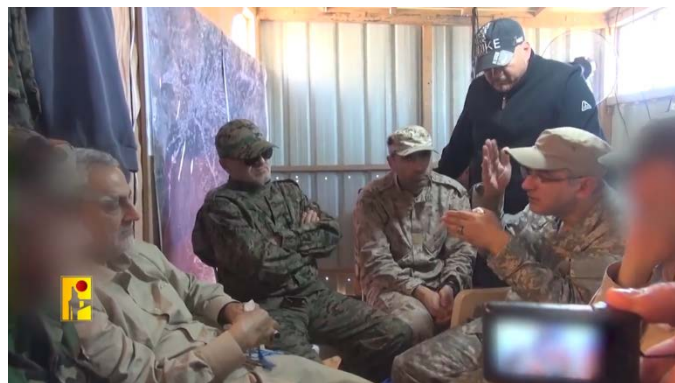
Aqil (right) with Qassem Soleimani (left), the former commander of the Qods Force, and other Hezbollah officials