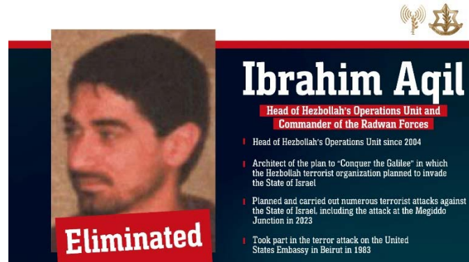
Aqil's "identity card" (IDF spokesperson, September 20, 2024)

terrorist operatives were killed in the attack, including senior Radwan Force commanders. Aqil and the others were responsible for orchestrating and executing hundreds of terrorist attacks on Israel, and were planning a Hezbollah invasion and attack on the cities, towns and villages in the Galilee (IDF spokesperson, September 21, 2024).