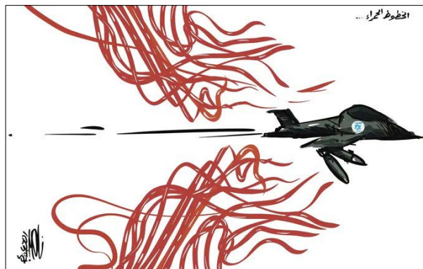
A cartoon in the Palestinian daily al-Quds captioned, "The Red Lines" (al-Quds, September 21, 2024)

►The Popular Front for the Liberation of Palestine (PFLP) claimed the attack had been jointly planned by Israel and the United States. The organization called it a policy of deliberate escalation designed to damage infrastructure, civilian facilities and harm innocent civilians "with the unsuccessful aim of breaking the resistance." It claimed that "attacking the commanders will not would break the determination of the resistance, which can compensate for its losses" (PFLP central media information department Telegram channel, September 21, 2024).