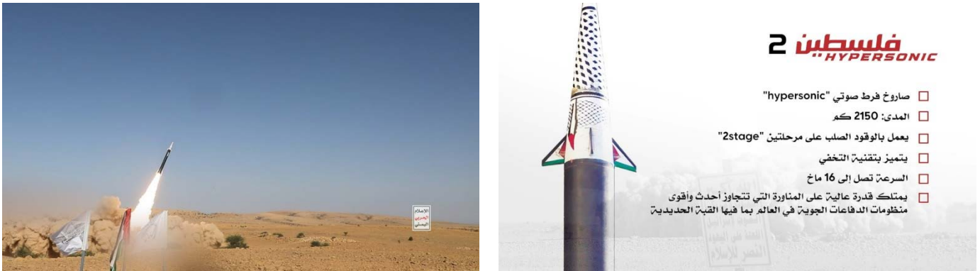
Left: Filastin 2 missile fired at Israel. Right: Technical characteristics of the missile

►The Houthi armed forces also released purported footage of the launch of the missile called Filastin 2 (“Palestine 2”). They claimed it is a two-stage hypersonic missile capable of reaching speeds of Mach 16 and a range of 2,150 kilometers, with stealth capabilities that allow it to evade the world’s most advanced air defense systems, including the Iron Dome (Houthi forces’ media arm X account, September 16, 2024).