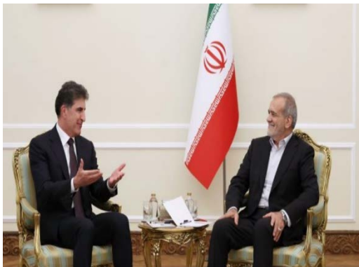
The Iranian president meets with the president of the Kurdish region

The Iran president then went on to visit the Shiite holy cities of Najaf and Karbala (ISNA, September 12, 2024).