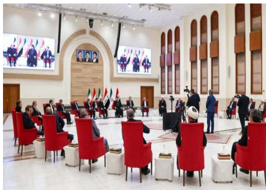
The Iranian president meets with leaders of the Shiite parties in Iraq (ISNA, September 11, 2024)

►Pezeshkian also met with the leaders of the Shiite pro-Iranian parties in Iraq in the presence of the Iraqi prime minister and Sayyid Ammar al-Hakim, chairman of the National Wisdom Movement. The president said that if the Islamic countries were united, the United States, Europe, and Israel would not so easily bomb Muslims and then claim to be defending human rights and democracy (ISNA, September 11, 2024).