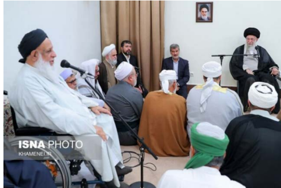
The Supreme Leader meets with Sunni clerics (ISNA, September 16, 2024)

►Iranian Supreme Leader Ali Khamenei said at a meeting with Sunni clerics on the occasion of Muslim Unity Week that support for the “oppressed of Gaza and Palestine” is one of the unequivocal obligations. He noted that anyone who disobeys this duty will be questioned by God (ISNA, September 16, 2024).