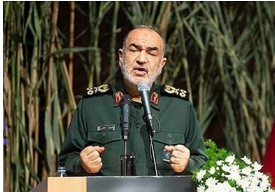
The IRGC commander (Tasnim, September 13, 2024)

► IRGC commander Hossein Salami commented on the situation in the Gaza Strip, saying that it is difficult and heartbreaking to witness the resistance of its residents and their daily suffering and deaths. However, he said, the secret of the Palestinians’ survival stems from jihad, “resistance,” and steadfastness. He noted that the Palestinians would soon taste the sweet taste of victory, just as their enemies would soon taste the painful taste of revenge for their evil deeds (Tasnim, September 13, 2024). Asked by journalists about Iran’s reaction to the killing of Ismail Haniyeh in Tehran, Salami said it was certain, would come at the appropriate time, and that its details could not be discussed (Tasnim, September 14, 2024).