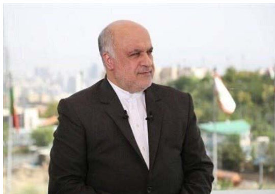
The Iranian ambassador to Beirut (Tasnim, September 17, 2024)