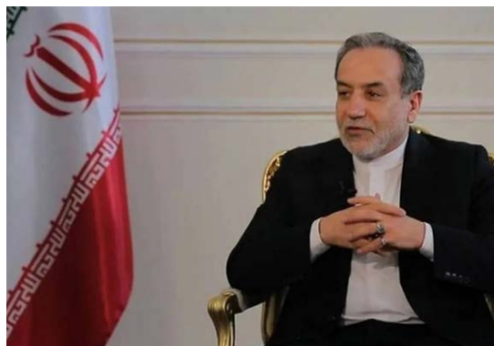
Iranian Foreign Minister Abbas Araghchi

► Iranian Foreign Minister Abbas Araghchi said Iran’s policy was unlimited support for the “resistance.” He said the “Zionist regime” had so far failed to achieve its main goal of destroying Hamas. He added that Iran had wisely neutralized the traps that might have dragged it into war (Iranian TV, September 15, 2024).