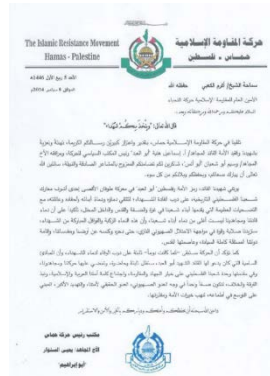
The letter from Sinwar to al-Kaabi (Nun Telegram channel, September 12, 2024)