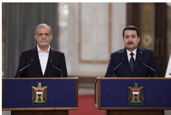
The Iranian president and the Iraqi prime minister (ISNA, September 11, 2024)

►At a joint press conference with the Iraqi prime minister, Pezeshkian stressed the importance of expanding relations between the two countries. According to him, the implementation of the security agreement between the two countries is essential to fight terrorists and enemies who endanger stability and security in the region. He said that through unity among the Islamic countries, it would be possible to prevent the continuation of the “crimes of the Zionist regime” (Mehr, September 11, 2024).