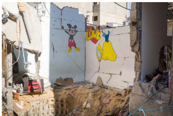
The opening of the tunnel shaft in the children's room

► This past week Israeli Air Force aircraft continued to attack terrorist operatives and facilities operating from civilian sites in the Gaza Strip and attacking IDF forces and the State of Israel. In all cases preliminary steps were taken to reduce possible harm to civilians. The terrorist organizations in the Gaza Strip, especially Hamas, have typically used civilian sites such as schools, hospitals and shelters for terrorist purposes. The terrorist organizations exploit IDF reprisals for propaganda and incitement purposes while exaggerating the number of victims and their alleged injuries, and in most instances concealing the identity of the terrorists who were attacked: 2