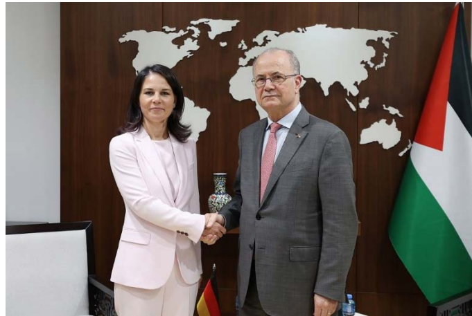
Mustafa and Baerbock (Vafa, September 6, 2024)

reconstruction of the Gaza Strip after the end of the "aggression." Baerbock addressed the importance of reaching a ceasefire agreement and halting the latest escalation in Judea and Samaria, which she claimed included the destruction of EU- and German-funded facilities (Wafa, September 6, 2024).