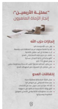
Hezbollah's Operation Arba'in notice (Simia, August 26, 2024)

◆ Simia, the electronic unit of Hezbollah's Executive Committee, issued a notice called Operation Arba'in, which claimed the organization had reacted in a "strong, considered" manner and had not dragged the region into war. It listed as its achievements equating Tel Aviv with the Dahiyeh, exposing the extent of its infiltration of Israeli intelligence, attacking 110 km inside Israeli territory, hitting targets and evading the Iron Dome and Arrow aerial defense systems and defending all its UAV positions against enemy attack. It listed the "enemy's failures" as "a new failure for Israeli intelligence." Israel's proactive [allegedly] action failed to prevent the Hezbollah's retaliation, the Israeli government [allegedly] had to "invent" a new false narrative which did not even convince the Israeli public, Israel's defense systems failed to intercept the rockets and UAVs, and Israel had carried out 40 attacks which hit only a number of launch sites (Simia, August 26, 2024).