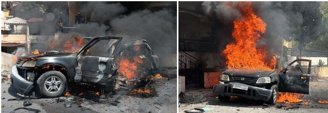
Halihali's vehicle after the attack near Sidon (Right: al-'Ahed, August 26, 2024. Left: al-Nahar, August 26, 2024)

lower part of his body was seriously injured (al-Nahar; al-'Ahed, August 26, 2024). A "Lebanese security source" claimed Halihal had been "slightly injured" (al-Jazeera, August 26, 2024).