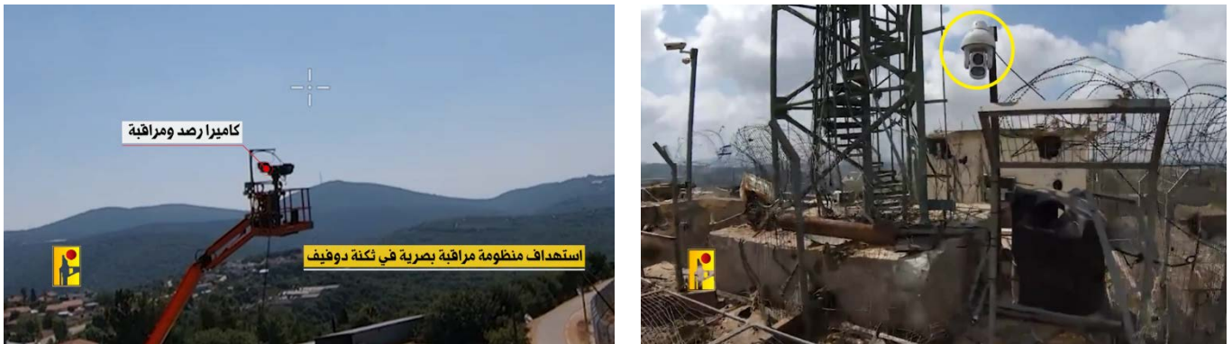
Explosive drone attacks on surveillance cameras located at IDF posts (Right: Hezbollah combat information Telegram channel, August 28, 2024. Left: Hezbollah combat information Telegram channel, August 29, 2024)

► The attacks according to Hezbollah (Hezbollah combat information Telegram channel, as of 1 p.m., August 26 - September 2, 2024):