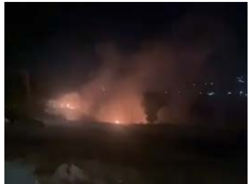
Right: The attack on the truck in the Lebanon Valley. Left: Attack on a building in al-Adeisa