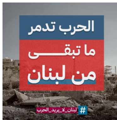
"The war is destroying what remains of Lebanon" (Raymond Hakim's X account, August 11, 2024)

◆ Raymond Hakim, an activist for the implementation of UN Security Council Resolution 1701 (with an X account of 99 thousand followers), wrote that Hezbollah's weapons posed a danger to Lebanon before they posed a danger to any other country (Raymond Hakim's X account, August 8, 2024). He also posted a picture of a building which had been destroyed with the caption, "The war is destroying what remains of Lebanon," with the hashtag "Lebanon_does_not_want_war." He also wrote, "The party [Hezbollah] is committed to the destruction of Lebanon. The funds he [Hassan Nasrallah] receives from Iran command him to do so" (Raymond Hakim's X account, August 11, 2024).