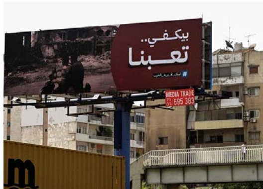
"Enough... we're tired" (Sawt Kol Lebanon, August 12, 2024)