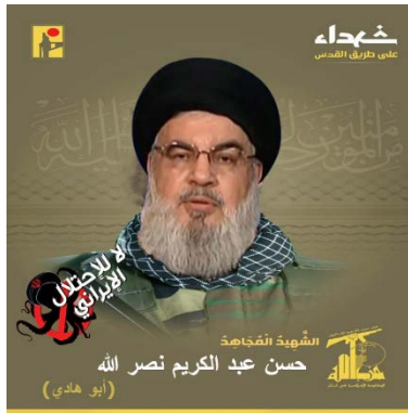
A Hezbollah-style mourning notice for Nasrallah (No to the Iranian Occupation X account , August 8, 2024).