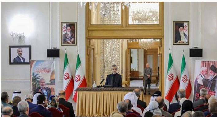
Meeting between the acting Iranian foreign minister and foreign representatives in Tehran