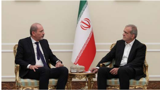
Meeting between the Iranian president and the Jordanian foreign minister (Iranian president's website, August 4, 2024)

▶ On August 4, 2024, Jordanian Foreign Minister Ayman al-Safadi made an unusual visit to Iran to discuss regional developments and escalation amid Iranian threats to attack Israel in response to Haniyeh's death. During his visit, al-Safadi met with Iranian President Masoud Pezeshkian and with Acting Iranian Foreign Minister Ali Bagheri Kani. The president told the Jordanian foreign minister that killing Haniyeh was contrary to all international laws and a "big mistake on the part of the Zionists" that would not go unanswered (Tasnim, August 4, 2024).