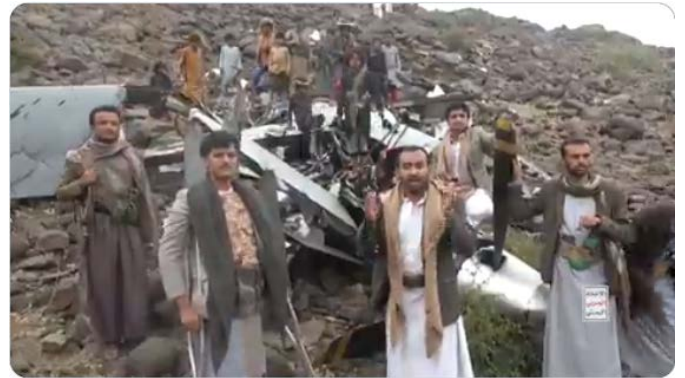
Right: Houthi fighters with the wreckage of the downed American drone. Left: Infographic describing the seven American UAVs shot down by the Houthis so far (Houthi forces' media arm X account, August 4-5, 2024)

► The US Central Command (CENTCOM) reported during the week that its forces had destroyed two UAVs, an unmanned surface vessel (USV), and three anti-vessel ballistic missiles in the Red Sea and three drones over the Gulf of Aden. In addition, CENTCOM forces destroyed a UAV and a missile and launcher in airstrikes in Houthi-controlled areas in Yemen (CENTCOM X account, July 31-August 7, 2024).