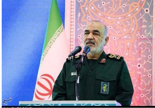
The IRGC commander (Tasnim, August 5, 2024)

grave, and when it received an overwhelming response, it would realize that it made a mistake in its calculations (Tasnim, August 5, 2024).