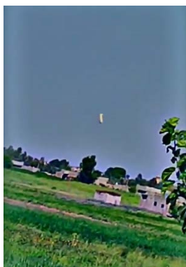
The American observation balloon falls to the ground