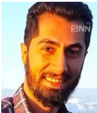
IRGC officer killed in the Israeli attack in Beirut (snn.ir, July 31, 2024)

Zionism was growing day by day and that the Iranian public and all freedom lovers around the world were demanding the elimination of the “Zionist regime” (ISNA, August 3, 2024).