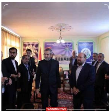
Acting Iranian foreign minister visits the Hamas office in Tehran