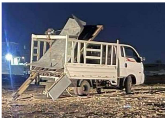
The truck from which the rockets were fired at the Ain al-Assad base (shahokurdy X account, August 5, 2024)

▶ According to the Iraqi Political Information Department, the attack on the Ain al-Assad base was carried out with two rockets launched from the Haditha area, and the Iraqi security forces seized a vehicle containing eight of the ten rockets prepared for launch. According to the announcement, the Iraqi forces will not allow “the land of Iraq to become an arena for settling scores and for it to be dragged into the predicaments of wars and the consequences of conflicts” (the Iraqi Political Information Department X account, August 6, 2024). Three suspects were reportedly detained in western al-Anbar in Iraq on suspicion of involvement in the attack against the Ain al-Assad base (al-Arabiya X account, August 6, 2024).