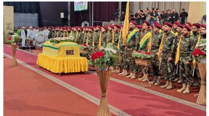
Right: Shukr's coffin (al-'Ahed, August 1, 2024).