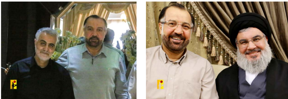
Right: Fuad Shukr and Hassan Nasrallah. Left: Fuad Shukr and Qassem Soleimani

►According to Hezbollah, Shukr was born al-Nabi Sheeth in the Lebanon Valley in 1961, was one of the founders of the organization and reportedly played a leadership role in the establishment and organization of the first Islamic "resistance groups" in Lebanon. He had been a member of Hezbollah's Jihad Council since its inception and also served on the Shura Council for certain periods. Hezbollah published videos and photos of Shukr throughout the years of his activity in the organization. He was photographed with Hassan Nasrallah, Hezbollah secretary general, with Imad Mughnieh, its former military commander (killed in an explosion in Syria in February 2008) and with Qassem Soleimani, former commander of the IRGC's Qods Force (killed in an American attack in January 2020).