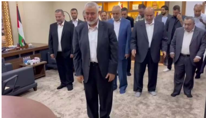
Haniyeh and Hamas figures at prayer on October 7, 2023, offering thanks to Allah (Hamas Telegram channel, October 7, 2023)

► On October 7, 2023 Haniyeh and several other senior Hamas figures abroad, were documented holding a thanksgiving prayer at a hotel in Qatar while al-Jazeera TV broadcast live the Hamas terrorist attack and massacre in Israel. Haniyeh issued an announcement of Operation al-Aqsa Flood and claimed it was a reaction to the "criminal Zionist aggression" against al-Aqsa Mosque, along with the issues of the holy places and the prisoners. He expressed hope that the "campaign" which began in the Gaza Strip would spread to Judea and Samaria and beyond, and wherever the Palestinians and the Arab nation were (Hamas Telegram channel, October 7, 2023).