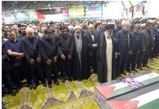
Haniyeh's funeral service in Tehran

►On August 1, 2024, Haniyeh's funeral ceremony was held in Tehran, attended by the heads of the Iranian government, including its leader, Ali Khamenei; a senior Hamas delegation led by Khalil al-Haya, a member of the Hamas political bureau and deputy head of the movement in the Gaza Strip; Na'im Qassem, Hezbollah deputy secretary general; and Ziyad al-Nakhalah, Palestinian Islamic Jihad (PIJ) secretary general (Press TV, August 1, 2024). Hamas stated that the funeral ceremony would be held in Doha, the capital of Qatar, on August 2 and that Haniyeh would be buried in the city of Lusail, Qatar (Hamas leader's communications Telegram channel, July 31, 2024).