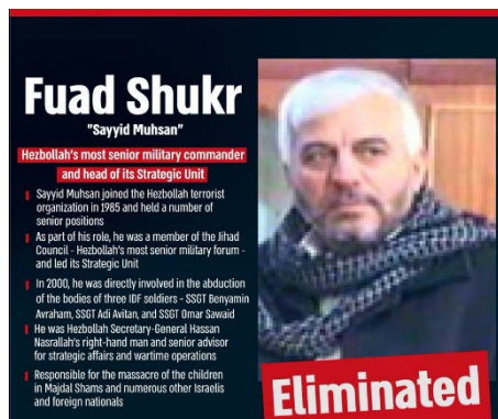
Shukr's ID

►The IDF spokesperson confirmed that the Israeli Air Force had attacked and killed Fuad Shukr, aka al-Hajj Muhsen, Hezbollah's most senior military commander and head of its strategic array. The IDF spokesperson reported that Shukr had been responsible for terrorist attacks which killed many Israeli civilians, including the rocket attack on Majdal Shams which murdered 12 children and teenagers on July 27, 2024.