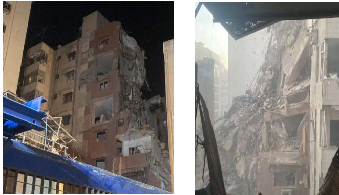
Partial destruction of the building in Beirut

Agency, July 31, 2024). The following day the number was updated to seven dead and 78 wounded (Lebanese Civil Defense, July 31, 2024).