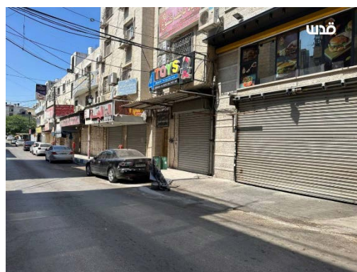
Right: General strike in Tulkarm.