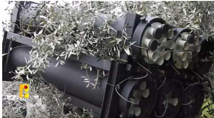
Right: Falaq 1 rocket launcher (Hezbollah combat information Telegram channel, March 28, 2024). Left: Remains of the rocket in Majdal Shams compared with a whole rocket (IDF spokesperson, July 28, 2024)