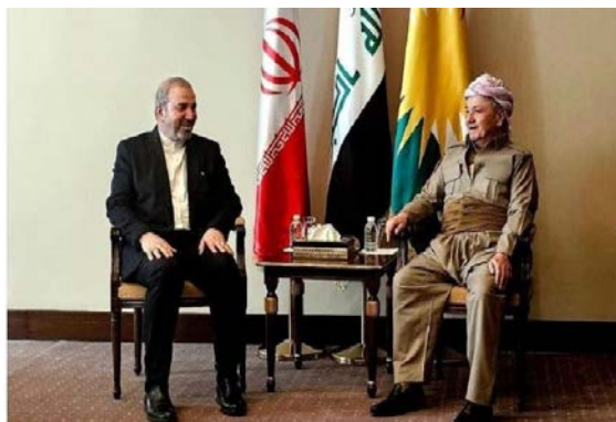
Iranian ambassador to Iraq meets with Masoud Barzani (the ambassador's X account, July 4, 2024)