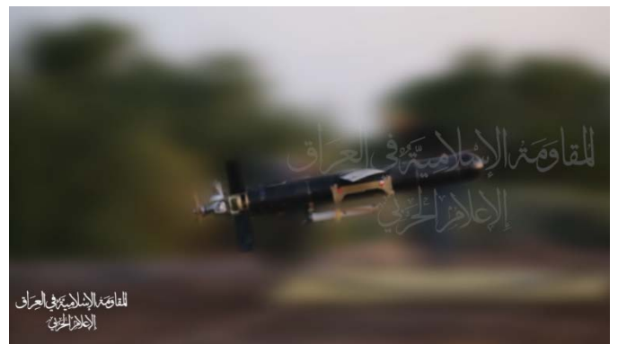
UAV being launched at a “vital target” in Eilat