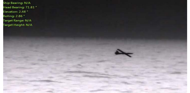
The interception of one of the UAVs by the Greek frigate