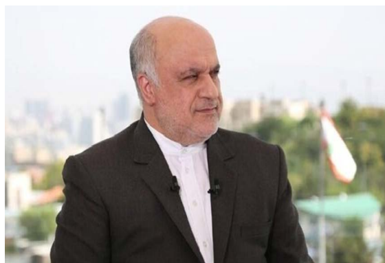
Iranian ambassador to Beirut