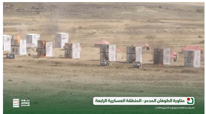
Footage from the Houthi military exercise (Yahya Saria’s X account, July 6, 2024)