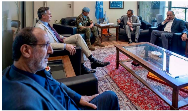
UNIFIL commander meets with members of the Lebanese Parliament (UNIFIL website, July 4, 2024)