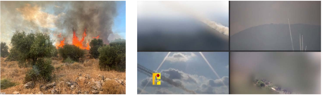
Right: Hezbollah launches rockets at IDF bases on July 7, 2024. Left: Fire in the Lower Galilee caused by rocket hits