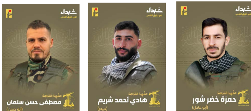
Hezbollah casualties (Hezbollah combat information Telegram channel, July 1-8, 2024)