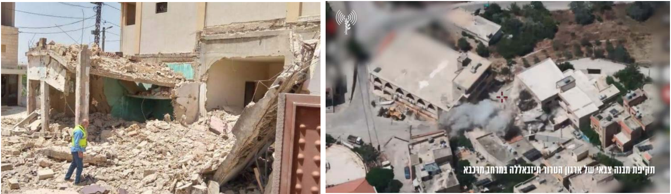
Right: Attack on the town of Markaba (IDF spokesperson's Telegram channel, July 5, 2024). Left: A building in Markaba after the attack (Fouad Khreiss' X account, July 5, 2024)

► In response to Hezbollah's attacks, Israeli Air Force fighter jets and UAVs attacked Hezbollah targets and operatives in south Lebanon and the Lebanon Valley. The targets included terrorist facilities, buildings used for military purposes, weapons storehouses depots, observation posts, launch sites, rocket launchers and a surface-to-air missile launcher to attack Israeli aircraft (IDF spokesperson, July 1-8, 2024).