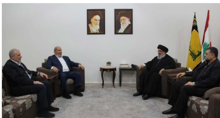
Nasrallah meets with Hamas representatives

► A "source close to Hezbollah" stated that the meeting focused on future cooperation, during and after the war, especially regarding training and supplies, and both movements noted their readiness to deal with any Israeli "thoughtless action" (al-Sharq al-Awsat, July 5, 2024).