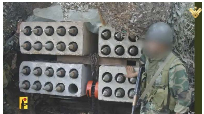
Right: Concrete Katyusha rocket launcher. Left: Vehicle-mounted artillery (al-Manar, July 6, 2024)