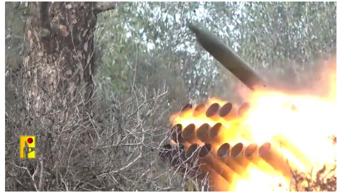
Missile and UAV launches