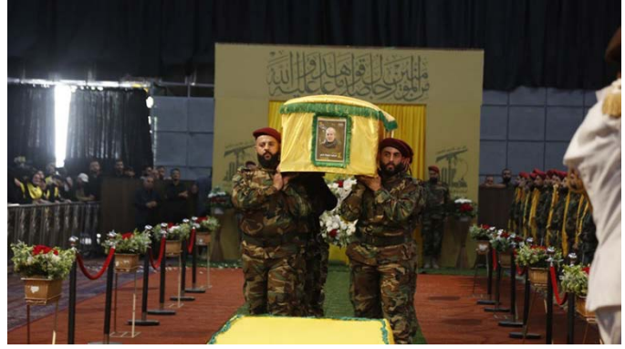
Nasser's coffin at the service in the Dahiyeh al-Janoubia (al-'Ahed, July 4, 2024). Left: Hezbollah figures at the internment in Hadatha (al-Akhbar X account, July 4, 2024)