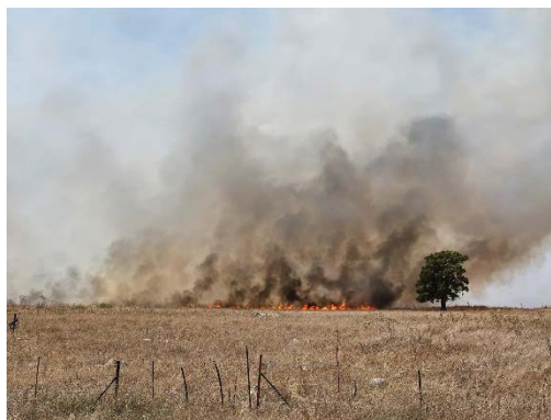
Fire in the Golan Heights caused by a rocket hit (Nature and Parks Authority, July 4, 2024)

► On July 4, 2024, the IDF spokesperson reported that UAVs and rockets had been identified penetrating Israeli airspace from Lebanese territory, and that aerial defense fighters and fighter jets had intercepted some of them. He reported that the alert in the Ilania region was a false alarm, contrary to Hezbollah's claim that it had attacked a military base in the area. The IDF confirmed that more than 200 rocket and 20 UAV launches had been detected. An IDF soldier was killed and three civilians were injured in the attacks. Debris from the interceptions and UAV hits caused fires in various areas of the Golan Heights, the Upper Galilee and the Western Galilee (IDF spokesperson and Israeli media, July 4, 2024).