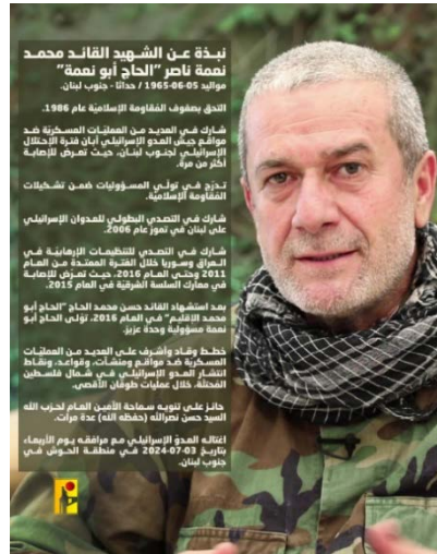
Milestones in Nasser's career (Hezbollah combat information Telegram channel, July 3, 2024)