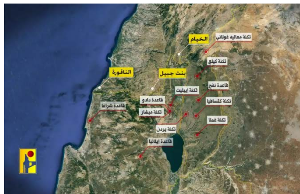
Map of the attacks (Hezbollah combat information Telegram channel, July 4, 2024)

► On July 4, 2024, the IDF spokesperson reported that UAVs and rockets had been identified penetrating Israeli airspace from Lebanese territory, and that aerial defense fighters and fighter jets had intercepted some of them. He reported that the alert in the Ilania region was a false alarm, contrary to Hezbollah's claim that it had attacked a military base in the area. The IDF confirmed that more than 200 rocket and 20 UAV launches had been detected. An IDF soldier was killed and three civilians were injured in the attacks. Debris from the interceptions and UAV hits caused fires in various areas of the Golan Heights, the Upper Galilee and the Western Galilee (IDF spokesperson and Israeli media, July 4, 2024).