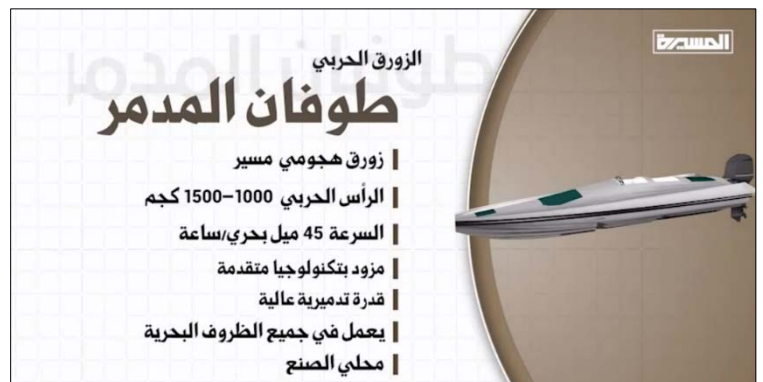
Right: Technical data from the video unveiling the USV. Left: Documentation of the alleged hit by the USV on the Transworld Navigator (Houthi forces X account, June 26, 2024)

► In his weekly speech, Houthi leader Abd al-Malik al-Houthi referred to the new weapons. He noted that the Tufan USV could carry a ton and a half of explosives and cause a huge explosion that would cause serious damage to “enemy” ships. He also said that the Hatem was an important missile “in name, deed, and in every sense of the word” and that the entry of the “destructive” missile would have great consequences (al-Masirah TV Telegram channel, June 27, 2024).