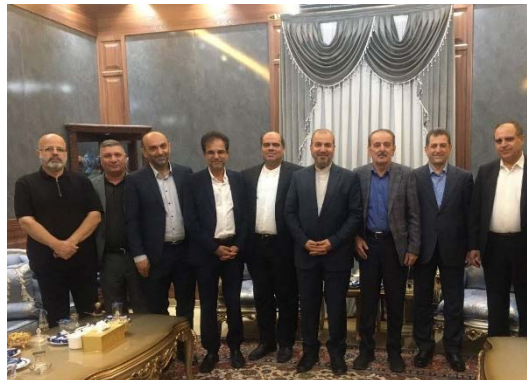
Iraqi media and press officials meet with the Iranian ambassador to Baghdad (IRNA, July 1, 2024)

► On July 1, 2024, a delegation of Iraqi media and press officials met with the Iranian ambassador to Baghdad, Mohammad Kazem Al-e Sadeq, to discuss expanding cultural and media cooperation between the two countries (IRNA, July 1, 2024).