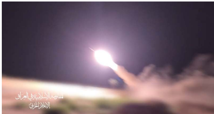
Launching a cruise missile at a “vital target” in Haifa (Islamic Resistance in Iraq Telegram channel, June 27, 2024)