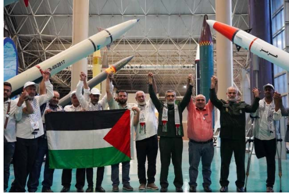
Hajizadeh meets with families of those killed in the war in Gaza (snn.ir, July 1, 2024)