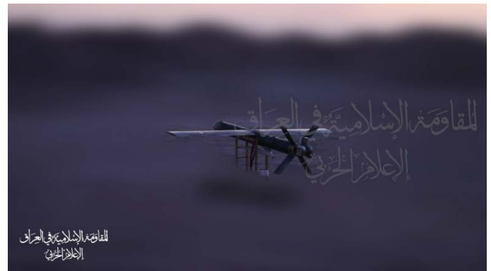
A drone being launched at Eilat (Islamic Resistance in Iraq Telegram channel, July 1, 2024)