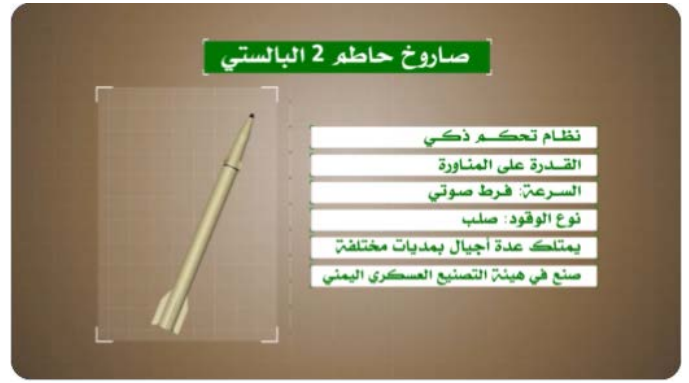
Right: Technical data of the Hatem 2 ballistic missile, from the video unveiling the missile. Left: The missile being launched en route to an alleged hit on the MSC SARAH (Houthi forces X account, June 26, 2024)

► On June 30, 2024, the Houthis unveiled the Tufan al-Mudammer (Destructive Flood) USV, which they claimed was used in the attack on the Transworld Navigator on June 23, 2024. They also released a video purportedly documenting the hit. According to the Houthi announcement, the USV can carry one to one and a half tons of explosives, reach a speed of 72 km/h (45 miles per hour), and can be controlled remotely or manually operated (Yahya Saria's X account, June 30, 2024).