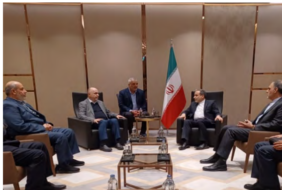
The Iranian foreign minister meets with a delegation of senior Hamas figures