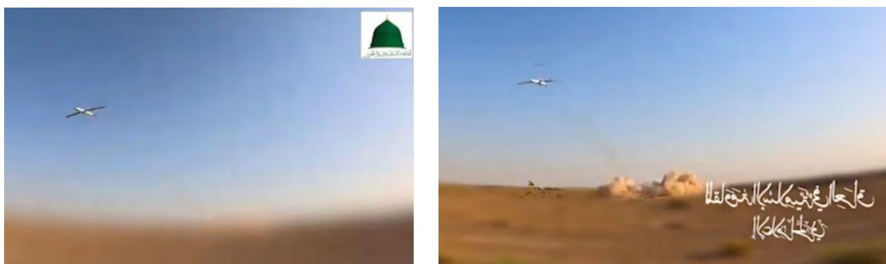
The original video (right) and the fabricated one (left) (Bilal al-Bukhari’s X account, October 26, 2024)

► It was claimed that it was a fictitious organization and that a video circulated on social media purportedly documenting the launch was actually a video released on July 15, 2024, by the Islamic Resistance in Iraq and digitally edited (Bilal al-Bukhari’s X account, October 26, 2024).