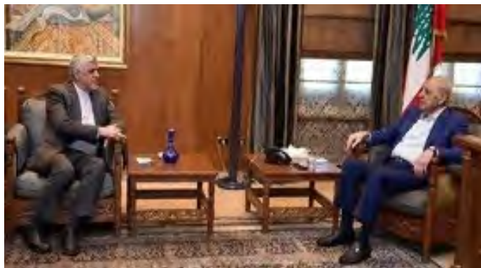
The representative of the Iranian foreign minister meets with the speaker of the Lebanese parliament