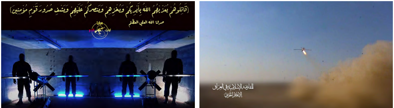
Right: Launching a drone at southern Israel (Islamic Resistance in Iraq Telegram channel, October 24, 2024). Left: Saraya Awliya al-Dam operatives preparing to launch drones (Saraya Awliya al-Dam Telegram channel, October 26, 2024)

the Saraya Awliya al-Dam militia issued 13 claims of responsibility for 14 attacks against targets in Israel, all using drones (Saraya Awliya al-Dam Telegram channel, October 15-30, 2024). The IDF Spokesperson reported the interception of eight drones that made their way into Israeli territory or penetrated Israeli airspace. In addition, another drone fell in the Red Sea before entering Israel, and four drones that penetrated Israel fell in open areas. There were no casualties (IDF Spokesperson, October 15-30, 2024).