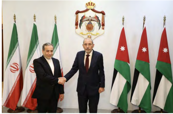
The meeting of the foreign ministers of Iran and Jordan