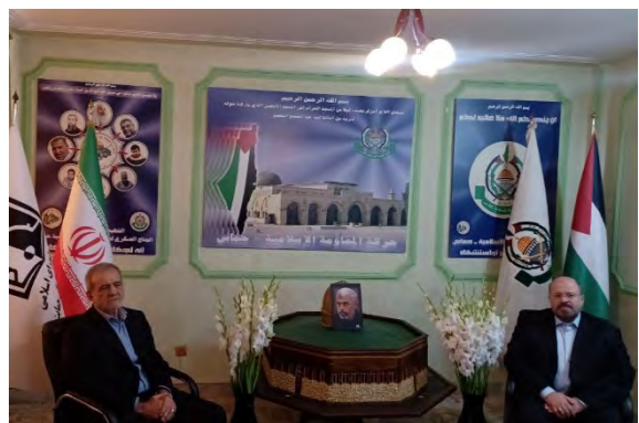
Right: The Iranian president visits the Hamas office in Tehran.