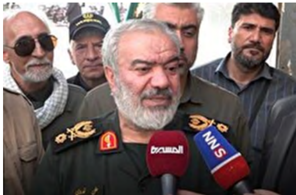
Acting IRGC commander Ali Fadavi

► Acting IRGC commander Ali Fadavi said on the sidelines of the memorial ceremony for senior IRGC commander Abbas Nilforoushan, who was killed in an airstrike in Beirut on September 27, 2024, in which Hezbollah secretary-general Hassan Nasrallah was killed, that geographically, the “occupied territories” [i.e. Israel] are not even as large as one of the smallest provinces in Iran, and if Iran so desires, it can destroy all the “Zionists.” He noted that the Islamic revolution is getting stronger year by year and the enemies are weakening more and more. According to him, the “resistance front” is expanding throughout the region, advancing rapidly, and acting as one in Iraq, Syria, Palestine, and Yemen.