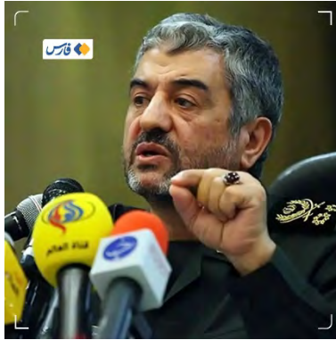
Mohammad-Ali Jafari (Fars, October 23, 2024)

stand forcefully against the “enemy,” as in the Second Lebanon War, thanks to its cohesion and talented personnel (Fars, October 23, 2024).