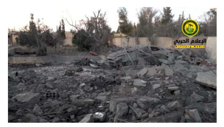
Ruins of a Nujaba Movement building in the Damascus area (Nujaba Telegram channel, May 9, 2024)