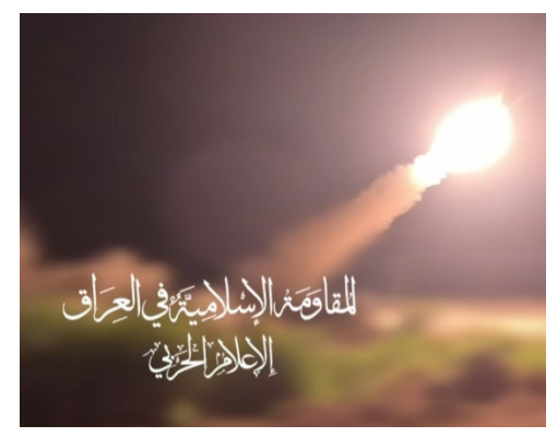
Right: Missile being launched at the Ramon base (Telegram channel of the Islamic Resistance in Iraq, May 11, 2024). Left: Aircraft being launched at a "military target" in Eilat (Telegram channel of the Islamic Resistance in Iraq, May 15, 2024)