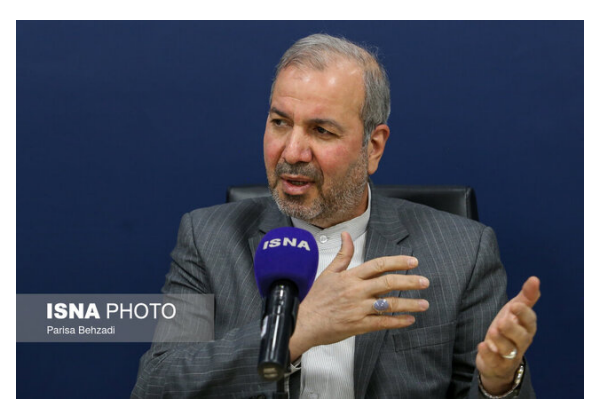
The Iranian ambassador to Baghdad (ISNA, May 12, 2024)

saying that the "resistance" groups in the countries of the region were independent, making their own decisions and acting in their own interests.