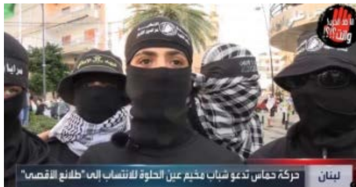
A boy who joined "Pioneers of the al-Aqsa Flood" ("The 2006 war is remembered and will not be repeated" X account December 12, 2023)

► In December 2023, Hamas announced a new youth movement called "Pioneers of the al-Aqsa Flood" in the Palestinian refugee camps in Lebanon, especially in Ein al-Hilweh. According to Hamas, its objective was to establish a cadre to serve as "a resistance vanguard force which will participate in the liberation of Jerusalem and al-Aqsa Mosque." In reality, the objective is to provide an organizational framework for ideological recruitment and to train young Palestinians in the refugee camps in Lebanon as terrorist operatives to fight Israel from the Lebanese border, following the model of youth movements of other terrorist organizations. 3