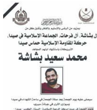
The announcement of Bashasha's death with the logos of Hamas (left) and al-Jamaa al-Islamiyya (saidaonline.com, January 4, 2024)