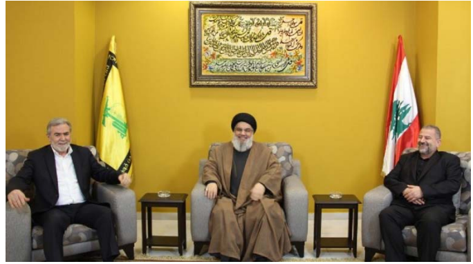
Right: al-'Arouri (right), Nasrallah and al-Nakhalah (left) (al-Manar, September 2, 2023).