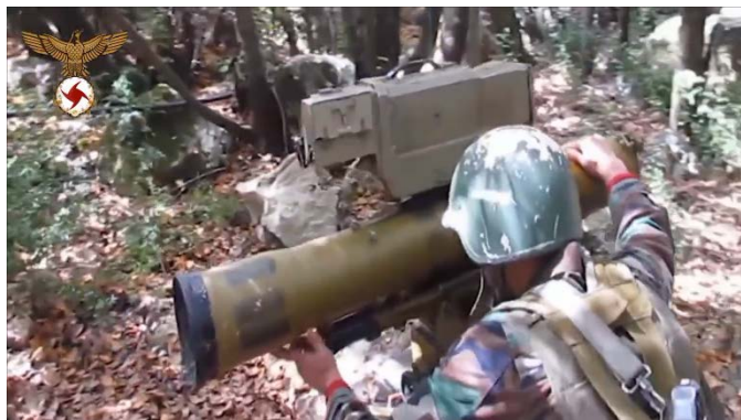
An operative next to an anti-tank missile (Eagles of the Storm X account, October 8, 2023)

[...] the occupier." They also wrote, "We promise and pledge to you that the struggle will continue until victory and liberation" (Eagles of the Storm X account, October 8, 2023).