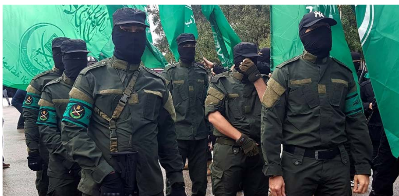
Al-Fajr operatives