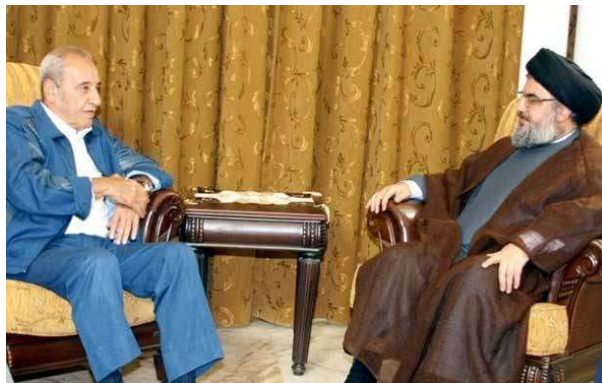
Hassan Nasrallah and Nabih Berri (al-Nashra, October 25, 2016)