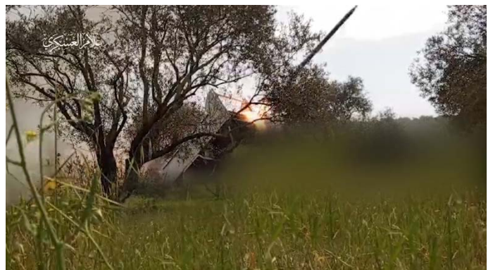
Launching rockets at IDF posts and camps on the northern border (Izz al-Din Qassam Brigades Telegram channel, May 3, 2024).