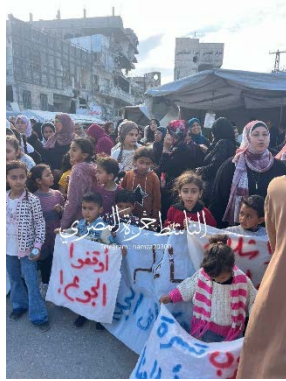
The demonstration in Beit Lahia (Hamza al-Masri's Telegram channel, April 28, 2025)