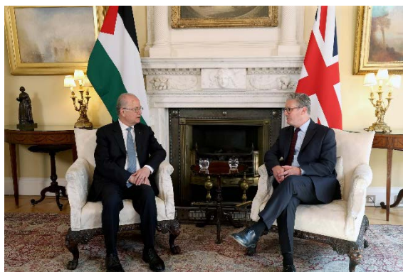
Mustafa meets with the British Prime Minister (Wafa, April 28, 2025)

► Mustafa met in London with British Prime Minister Keir Starmer and Foreign Minister David Lammy. They discussed the continuation of the Israeli "aggression" and the humanitarian crisis in the Gaza Strip, as well as Israeli actions in Judea, Samaria and east Jerusalem, and reaffirmed their commitment to the two-state solution. Britain expressed its commitment to recognizing a "Palestinian state" in the future. A memorandum of understanding for cooperation in areas such as development, education, trade and climate change was signed. In addition, a £101 million aid package was announced for the development of the Palestinian economy, the promotion of good governance and the provision of humanitarian assistance (Wafa, April 28, 2025).