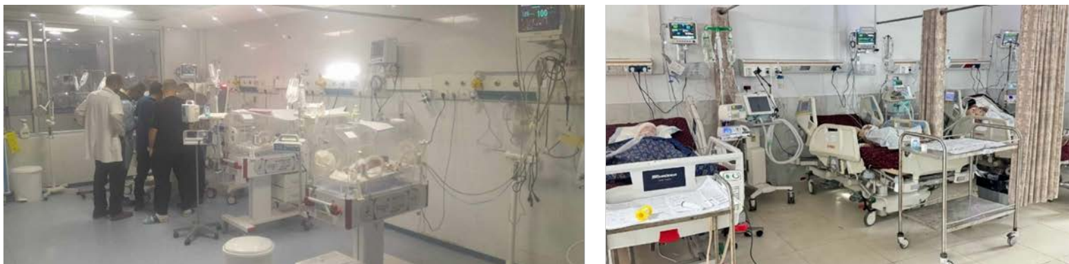
Right: Intensive care. Left: The neonatal unit at al-Helou Hospital (al-Shifa Medical Center Facebook page, April 23 and 24, 2025)