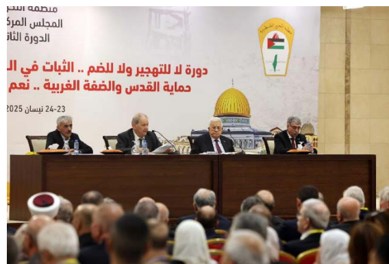
Mahmoud Abbas at the PLO Central Council meeting

◆ The committee of the deported prisoners [released from Israeli prisons in exchange for the release of hostages] issued a statement expressing loyalty to the path of "resistance" and the struggle to free the prisoners. They claimed "resistance" 7 was the only way to achieve "freedom and dignity for the Palestinian people," praised the steadfastness of the people in Gaza, Judea and Samaria as an example of "sacrifice and determination," and total opposed any attempt to harm or question the "resistance" (Qabatiya Around the Clock Telegram channel, April 24, 2025).