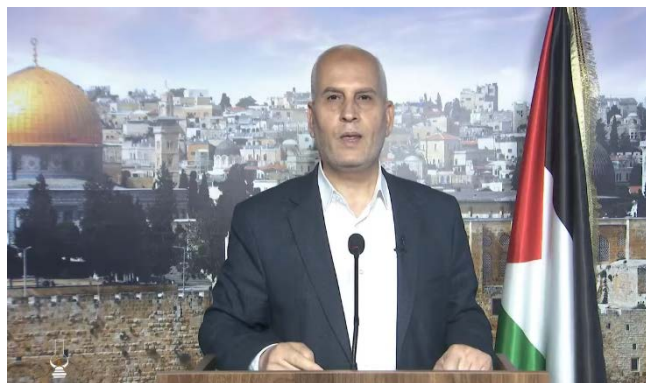
Fawzi Barhoum in his speech (Justice and Development Party website, April 26, 2025)

► On April 26, 2025, the annual conference of the Justice and Development Party [the local branch of the Muslim Brotherhood] opened in Morocco. A Hamas delegation headed by the movement’s spokesperson, Fawzi Barhoum, was expected to participate in the conference, leading to criticism and opposition in Morocco (Hespress website, April 22, 2025). On the eve of the conference, the chairman of the organizing committee announced that the Hamas delegation would not arrive (Hespress website, April 25, 2025). Speaking at the conference, the secretary general of the Justice and Development Party, Abdelilah Benkirane, said they had wanted the Hamas delegation to participate but the authorities did not grant its members entry visas (Hibapress website, April 26, 2025). Instead, at the opening session, a recorded speech by Fawzi Barhoum was aired, in which he praised Morocco’s public displays of solidarity with the Gaza Strip. He also called on the Arab and Islamic nations to rise up and support the Gaza Strip (aljazeera.net, April 26, 2025).