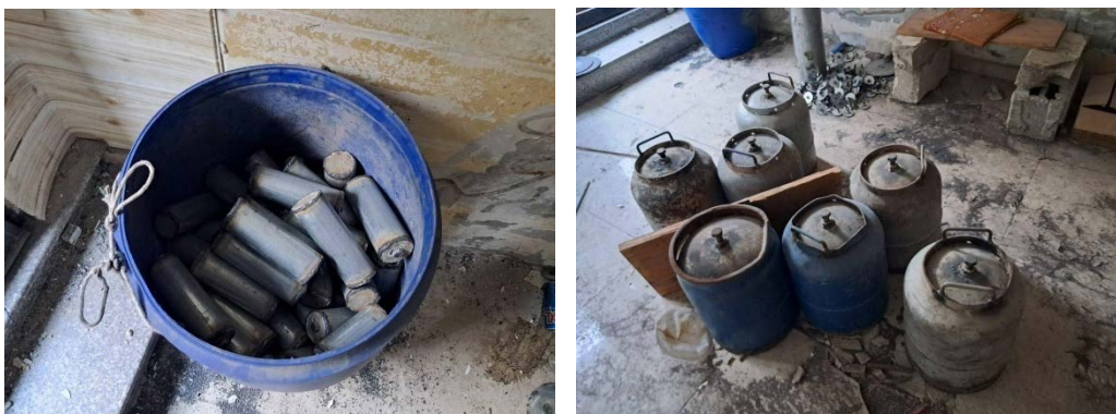
Weapons found in the lab in Tulkarm (IDF spokesperson, April 1, 2025)

detaining Palestinians wanted for involvement in terrorist operations and confiscating weapons and other terrorist materials (IDF spokesperson, April 1–7, 2025).