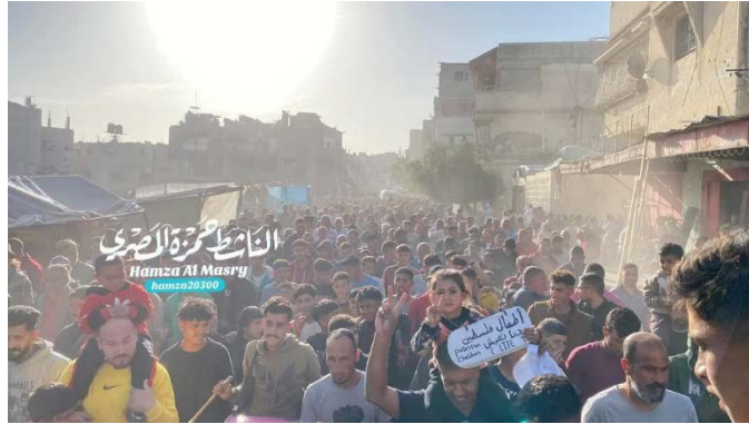
Protest demonstration in the northern Gaza Strip (Hamza al-Masri's Telegram channel, April 2, 2025)