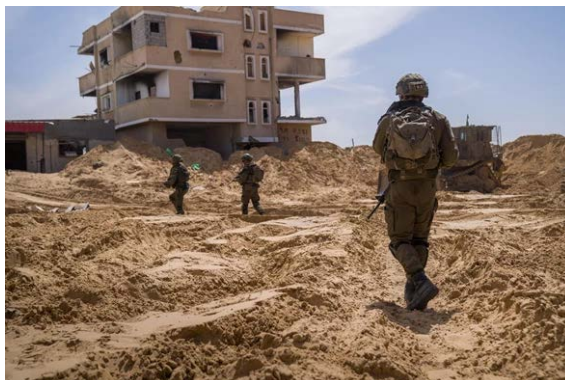
Right: The IDF in Tel al-Sultan, Rafah. Left: A map from the UN Office for the Coordination of Humanitarian Affairs (OCHA), showing 65% of the Gaza Strip off-limits or under active evacuation orders