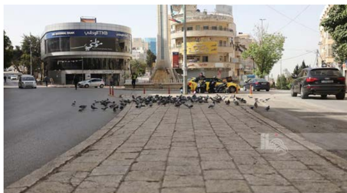
The general strike. Right: Ramallah (April 7, 2025). Left: Nablus (April 7, 2025)