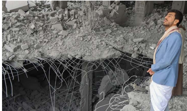
Destruction of a hospital in the Saada province as a result of US airstrikes (Al-Akhbar Telegram channel, March 27, 2025)