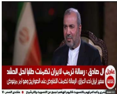
The Iranian ambassador to Iraq (Al-Sharqiya, March 27, 2025)

Iran. The ambassador stressed that Iran has taught the militias “how to fish” and now they do it themselves without the need for Iranian support, as do the other “resistance” forces in the region (Al-Sharqiya, March 27, 2025).