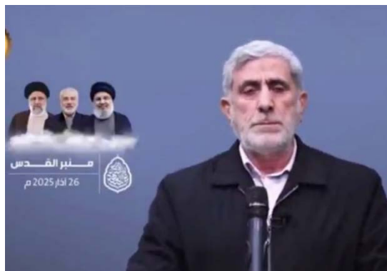
Qods Force commander in a recorded speech on the occasion of “World Jerusalem Day”

◆ The commander of the IRGC’s Qods Force, Esmail Qaani, said in a recorded speech on the occasion of “World Jerusalem Day” that the “crimes of the Zionist regime” and the support of the United States have not succeeded in limiting the “resistance” and that the “resistance in Palestine” is even stronger today than it was in the “Al-Aqsa Flood” attack in October 2023, and its scope has expanded throughout the world. He noted that the “unity of the arenas” during the war demonstrated the strength of the “resistance front” throughout the world. He emphasized that Iran had stood by the Palestinian people in defending Jerusalem before and after the “Al-Aqsa Flood,” both by supporting the fighters on the front lines and by taking direct military actions against Israel, such as the two Iranian attacks on Israel (in April and October 2024), and that it would continue to stand firm with the Palestinians and the “resistance” organizations in the region until the final victory was achieved and Jerusalem was liberated.