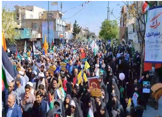
“World Jerusalem Day” rallies in Iran (ISNA, March 28, 2025)

► On March 28, 2025, “World Jerusalem Day” rallies were held throughout Iran. The rallies are held every year on the last Friday of Ramadan to mark the support of Iran and the “axis of resistance” for the Palestinian cause and the campaign to “liberate Jerusalem.” The rallies were attended by senior Iranian government figures, including President Masoud Pezeshkian, Majles Speaker Mohammad Bagher Ghalibaf, and Qods Force commander Esmail Qaani (Iranian news agencies, March 28, 2025).