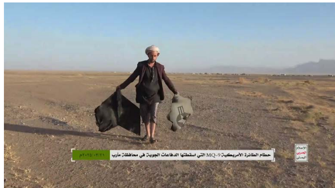
Houthi operative with drone remains (Houthi Combat Media Telegram channel, April 1, 2025)