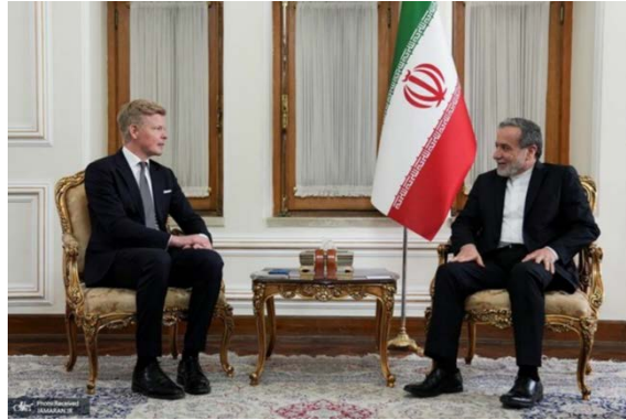
The Iranian foreign minister meets with the UN secretary-general's envoy to Yemen (Jamaran, March 29, 2025)

UN Security Council to the violation of international law by the United States and Israel and stressed the need for immediate action by the UN to stop their activities (Jamaran, March 29, 2025).