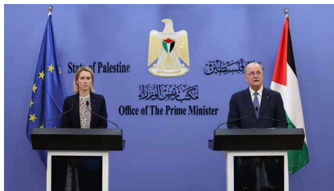
Mustafa and Kallas at the press conference

► Muhammad Mustafa, PA prime minister, held a press conference with Kallas, where he noted the "severity" of Israeli "violations" in Judea and Samaria, and the "forced displacement" of about fifty thousand Palestinians from the refugee camps in Jenin and Tulkarm, along with the destruction in the Gaza Strip. He called on the international community to intervene and hold Israel accountable, and thanked the EU for its support of the Palestinian government, reform and reconstruction efforts in the Strip, and called for active participation in the upcoming donors' conference in Cairo and the upcoming UN conference in New York led by Saudi Arabia and France. Kallas said the EU viewed the PA as a legitimate governing body for the Gaza Strip and would support it in the reconstruction process. She stressed that the continued destruction and the violence by settlers in Judea and Samaria undermined the chances of a two-state solution, the only path to sustainable peace.