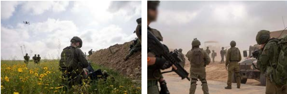
IDF forces in the Gaza Strip