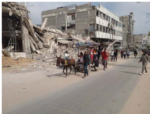
Right: Gazans leave Khan Yunis (Quds Agency Telegram channel, March 19, 2025). Left: Gazans leave Tel al-Sultan in Rafah (al-Aqsa TV Telegram channel, March 23, 2025)