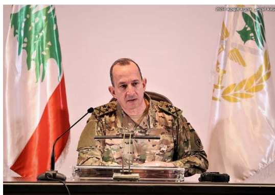
Rodolph Haykal speaking to senior army officers

► Rodolph Haykal met with the Lebanese army general command headquarters and commanders of major units and independent battalions. He promised the army would meet the challenges ahead, work to establish the state’s authority throughout Lebanese territory, continue implementing Resolution 1701 in coordination with the UNIFIL force and confront “the repeated aggression and violations of the Israeli enemy”.