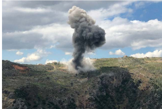
IDF strike in south Lebanon (al-Manar, March 22, 2025)

of Tyre and the Beqa'a region. The IDF attacked Hezbollah military command centers, terrorist operatives, rocket launchers and a weapons storage facility (IDF spokesperson and Israeli media, March 22, 2025).