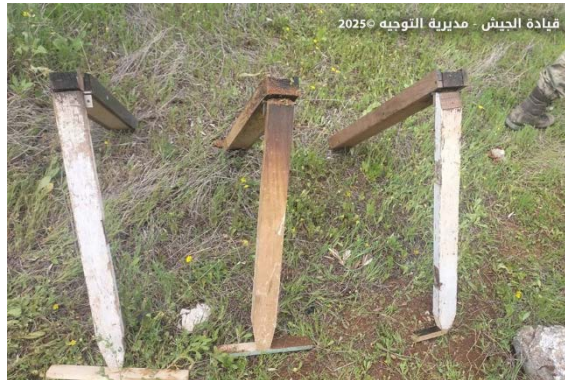
Improvised launch platforms discovered near the village of Tebnine (Lebanese army X account, March 22, 2025)