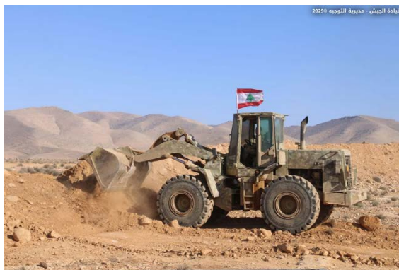
A Lebanese army tractor sealing illegal border crossings (Lebanese army X account, March 22, 2025)