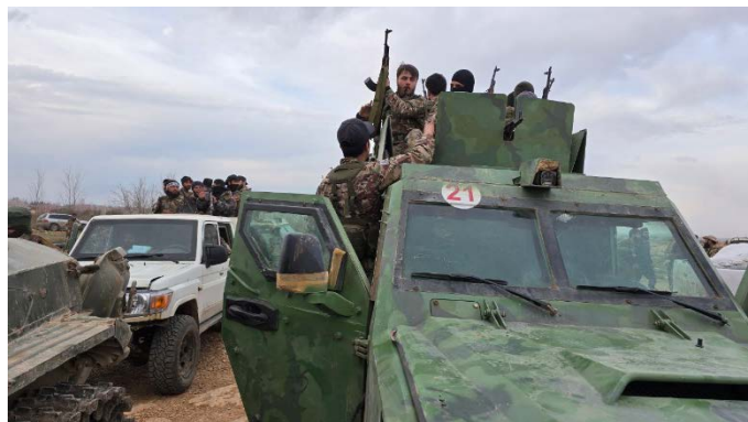
Right: Syrian army forces near the Lebanese border. Left: Weapons discovered in a Hezbollah hideout in the village of Khush al-Sayyid Ali (SANA, March 17, 2025)