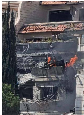
The building in Damascus after the attack

► On March 13, 2025, the IDF attacked a Palestinian Islamic Jihad (PIJ) headquarters in Mashrou Dummar, northwest Damascus, from the air. The headquarters was used for planning and directing terrorist attacks against Israel (IDF spokesperson, March 13, 2025). PIJ secretary general Ziyad al-Nakhalah had previously lived in the building; seven people were reportedly injured (al-Araby TV, March 13, 2025). PIJ spokesman Muhammad al-Hajj Musa claimed "Zionist aggression" had targeted an empty house rather than the organization's headquarters. He also expressed solidarity with the Syrian people, who he said were suffering from "the occupation and ongoing aggression" (Filastin al-Yawm, March 13, 2025).