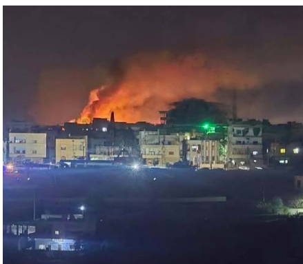
Strikes in Daraa (Daraa24 X account, March 17, 2025)

defense volunteers (Syria TV and SANA, March 17–18, 2025). The Islamic Resistance Front in Syria claimed one attack hit a site belonging to the Front, killing one fighter and injuring two others. The Front warned it would not remain silent about the attack and would respond "appropriately" (Telegram channel South Lebanon - Enemy Watcher, March 17, 2025).