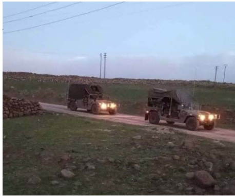
IDF forces in the village of al-Nasira, on the Quneitra-Daraa border (Daraa24 X account, March 19, 2025)

► On March 13, 2025, the IDF attacked a Palestinian Islamic Jihad (PIJ) headquarters in Mashrou Dummar, northwest Damascus, from the air. The headquarters was used for planning and directing terrorist attacks against Israel (IDF spokesperson, March 13, 2025). PIJ secretary general Ziyad al-Nakhalah had previously lived in the building; seven people were reportedly injured (al-Araby TV, March 13, 2025). PIJ spokesman Muhammad al-Hajj Musa claimed "Zionist aggression" had targeted an empty house rather than the organization's headquarters. He also expressed solidarity with the Syrian people, who he said were suffering from "the occupation and ongoing aggression" (Filastin al-Yawm, March 13, 2025).