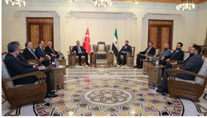
The Turkish delegation meets with al-Sharaa (March 13, 2025)