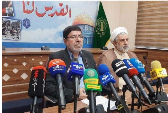
Meeting of the Central Headquarters of the World Jerusalem Day events (Mehr, March 15, 2025)

revived the spirit of the “resistance,” led to internal divisions and an identity crisis in the “occupied territories” (i.e., Israel), and the failure of normalization between the “Zionist regime” and the Arabs (Mehr, March 15, 2025).