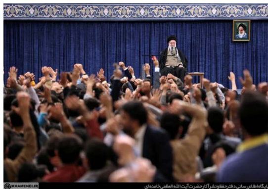
The Supreme Leader of Iran (Iranian Supreme Leader’s website, March 12, 2025)

► Iranian Supreme Leader Ali Khamenei said in a speech at a meeting of students on the occasion of Ramadan that the deaths of senior members of the “resistance front,” including Ismail Haniyeh, Yahya al-Sinwar, Muhammad al-Deif, and Hassan Nasrallah, had not harmed the Palestinian and Lebanese resistance, but only strengthened its motivation. He noted that this was evident in Hamas’ success in imposing its conditions on Israel in the negotiations for a ceasefire in the Gaza Strip. Khamenei stressed that Iran would continue to support the “resistance” in “Palestine” and Lebanon with all its capabilities and that there is a consensus on the issue among senior regime figures in Tehran (Iranian Supreme Leader’s website, March 12, 2025).