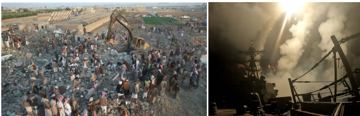
Right: US cruise missiles being launched during the strikes. Left: Destruction in the Houthi areas

► In light of the attacks, it was reported that some of the Houthi leaders had left Sana'a for Saada and Amran and that they had been instructed not to stay in government buildings and headquarters that could be attacked. In addition, it was reported that the Houthis had emptied some of their missile depots after the American attacks (Al-Hadath, March 16, 2025).