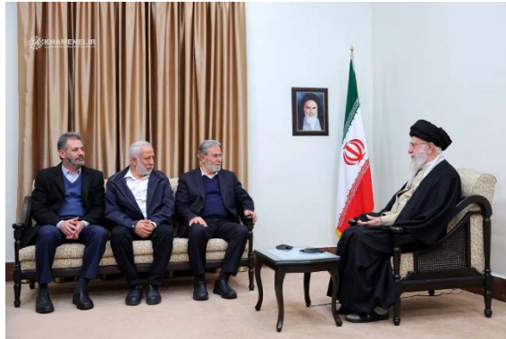
Khamenei meets the PIJ delegation (Iranian supreme leader's Telegram channel, February 18, 2025)

◆ Iranian President Pezeshkian said Iran would always stand with the Palestinian people and the "Islamic resistance," adding that Islamic countries had to cooperate to help the Palestinian people and the Gazans rebuild the Strip. Al-Nakhalah thanked Iran for its unprecedented support, and said he appreciated the bravery of Hezbollah and the "brothers in Yemen." He said Israel was now seeking to achieve politically what it had failed to achieve militarily, and Israel's supporters were paving the way for its success arena, necessitating greater vigilance (PIJ Information Office Telegram channel , February 20, 2025).