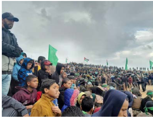
Spectators watch the "ceremony" (Israeli foreign ministry Facebook page in Arabic, March 20, 2025)

► On February 20, 2025, Hamas transferred four bodies of murdered Israeli civilians during a "ceremony" held in Bani Suheila in the southern Gaza Strip. The event was attended by hundreds of Palestinians, including many children, as well as several Palestinian prisoners serving life sentences who had been previously released from Israeli prisons (Aram News, February 20, 2025).