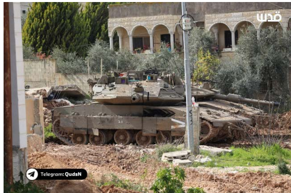
Right: An Israeli tank in the Jenin refugee camp. Left: Weapons found during Operation Iron Wall