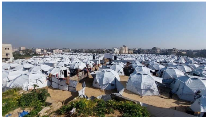
The tent city in Jabalia (Jabalia al-Nazla municipality Facebook page, February 20, 2025)

► The Jabalia al-Nazla municipality, in cooperation with the emergency committee of western Jabalia, the ministries of public works and welfare, plus support and partner organizations, erected a tent camp in Jabalia for residents whose homes were destroyed. The camp covers a little more than 18 acres, is composed of one thousand tents divided into eight sub-camps and shelters one thousand families, about 5,000 people. The municipality also arranged for drainage, is working to upgrade essential water services and is organizing environmental facilities to prevent the outbreak of disease in the camp (Jabalia al-Nazla municipality Facebook page, February 20, 2025).