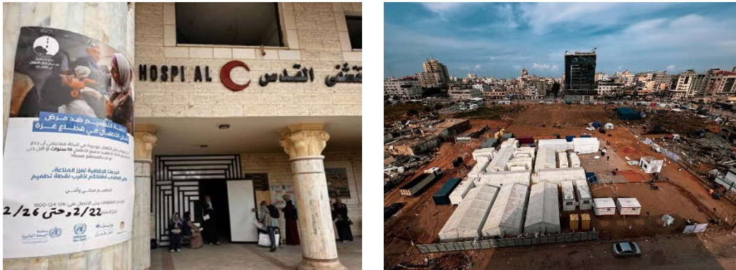
Right: The field hospital operated by the Palestinian Red Crescent in al-Saraya area of Gaza City (Palestinian Red Crescent in Gaza Facebook page, February 19, 2025); Left: Al-Quds Hospital participates in the polio vaccination campaign (Palestinian Red Crescent in Gaza Facebook page, February 21, 2025)

aiming for partial operation in the coming days (Palestinian Red Crescent in Gaza Facebook page, February 19, 2025).