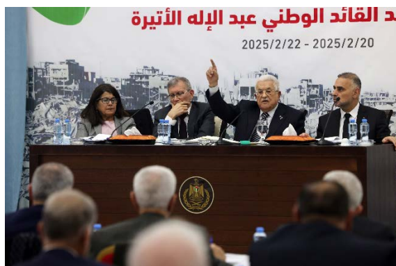
Mahmoud Abbas at the Fatah Revolutionary Council meeting (, February 20, 2025)

imprisoned (Fatah commission for information and culture Telegram channel, February 24, 2025).