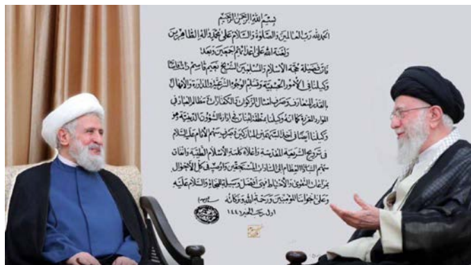
The Supreme Leader's decree (Tabnak, February 4, 2025)

► The Iranian media published a decree issued by Iranian Supreme Leader Ali Khamenei authorizing Hezbollah secretary-general Naim Qassem as his religious representative in Lebanon (Tabnak, February 4, 2025).