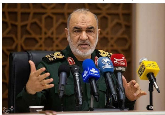
The IRGC commander (Tasnim, February 3, 2025)

► IRGC commander Hossein Salami spoke at an IRGC ceremony about the situation in Syria, saying that the enemies had achieved certain results due to matters that this was not the time to elaborate on, but that the situation would not remain the same. He also referred to developments in other arenas in the region, saying that the Palestinians fighting with stones continue to show great strength against Israel even after 16 months of war and that Hezbollah stands firm despite the severe blows it has suffered (Tasnim, February 3, 2025).