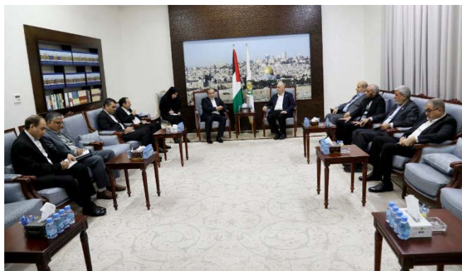
The Iranian foreign minister meets with the Hamas delegation (Hamas official Telegram channel, January 30, 2025)