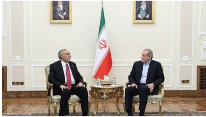
The Iranian president meets with the speaker of the Iraqi parliament