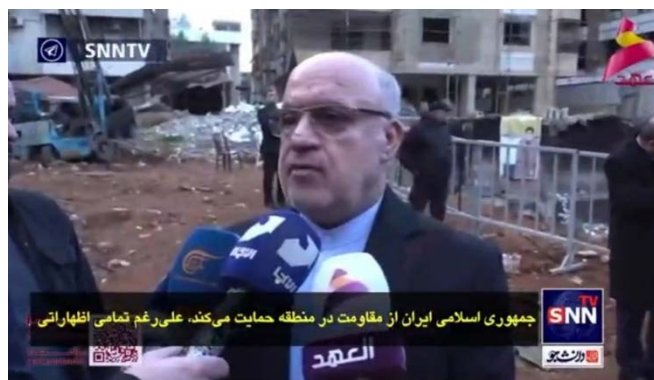
The Iranian ambassador to Lebanon