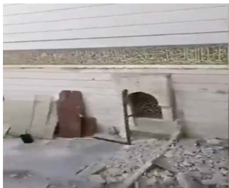
Renovation work at a Sunni mosque in Damascus (Tabnak, January 31, 2025)

► The Iranian media published a video titled "The Beginning of the Activity to Demolish the Tomb of Zaynab," documenting renovation work carried out by the Syrian authorities at the Omar Ibn al-Khattab Mosque in Damascus, which could damage the compound of the Tomb of Sayyida Zaynab, the holy site of the Shiites located near the mosque (Tabnak, January 31, 2025). The release of the video is an expression of increasing efforts by the Iranian media to highlight attacks on Shiite holy sites in Syria, the takeover of Alawite mosques to spread extremist Sunni Islamic ideas, and deliberate attacks against Alawites and Shiites, including arrests and executions, following the fall of the Assad regime. These efforts are intended to assist Iran in its political and diplomatic campaign against the new regime in Damascus, as well as to strengthen and encourage destabilizing trends in the country.