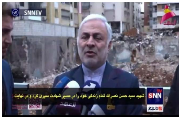
The Iranian deputy foreign minister at the compound where Nasrallah was killed in Beirut (snn.ir, February 1, 2025)

► Iranian Deputy Foreign Minister for Consular and Parliamentary Affairs Vahid Jalalzadeh visited Lebanon and met with senior Lebanese government officials, including Lebanese Foreign Minister Abdallah Bou Habib and Parliament Speaker Nabih Berri. Jalalzadeh expressed Iran’s willingness to assist Lebanon in dealing with Syrian citizens of Iranian origin who left for Lebanon after the fall of the Assad regime. The deputy minister visited the Dahiyeh compound in Beirut where Hezbollah secretary-general Hassan Nasrallah was killed. He stressed the importance of the “resistance” and Iran’s support for it (snn.ir; Al-Manar, February 1, 2025).