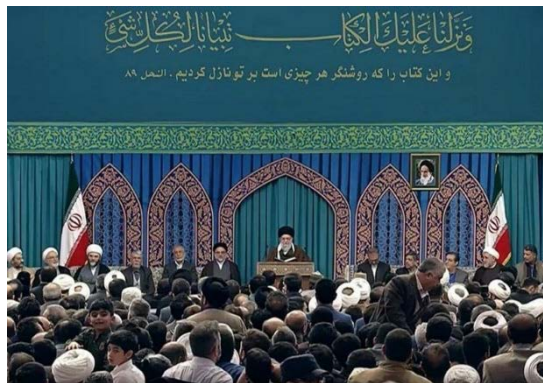
The Supreme Leader of Iran (Tasnim, February 2, 2025)

► Supreme Leader Ali Khamenei, speaking at a meeting with participants in an international Quran competition in Tehran, referred to the war in the Gaza Strip, saying that the “victory” of the residents of the Gaza Strip over the “Zionist regime” and the American regime serves as an example of the realization of the impossible. He said that if they had said that the residents of the small area of the Gaza Strip would fight a great power like the United States and win, no one would have believed it, but it was achieved by God’s will (Tasnim, February 2, 2025).