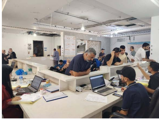
The Gaza Strip land authority at work after operations resumed