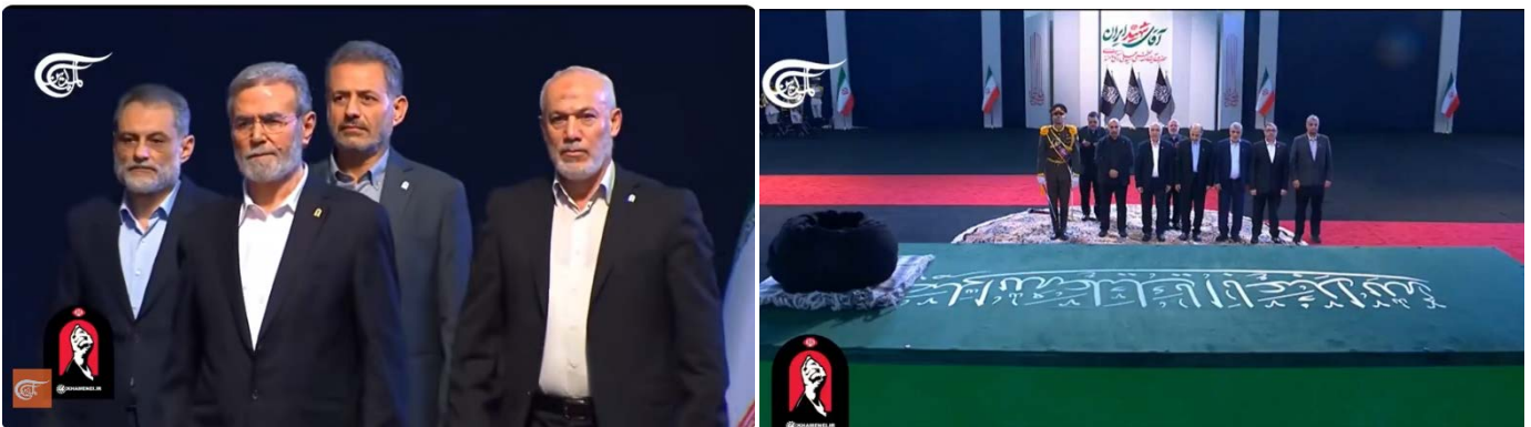
Right: The Hamas delegation. Left: The PIJ delegation