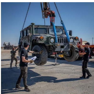
Arrival of tactical vehicles at the Endurance logistics support site of the international stabilization force (X account of the Board of Peace, June 30, 2026)