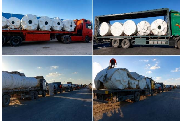
Equipment for water tankers brought into the Gaza Strip (COGAT X account, July 1, 2026)

► As part of the UAE initiative to assist Gaza, equipment for 80 water tankers was brought into the Gaza Strip to support the ongoing efforts to establish water storage facilities and improve access to water for the civilian population (COGAT X account, July 1, 2026).