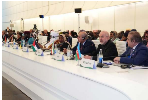
The Iranian Majles Speaker at the conference in Baku (Nour News, June 24, 2026)

► Majles Speaker Qalibaf referred in his speech at the conference of the Parliamentary Union of the OIC Member States to regional developments and said that the Palestinian issue is the central axis of security and stability in West Asia. According to him, it will not be possible to establish a stable security order in the region without a just solution to the Palestinian issue. He emphasized that from Iran’s point of view, the Palestinian people – like any other people in the world – have the right to self-determination, and that the final solution to the Palestinian problem should be determined through a referendum among the original inhabitants of “Palestine”: Muslims, Christians, and Jews (Nour News, June 24, 2026).