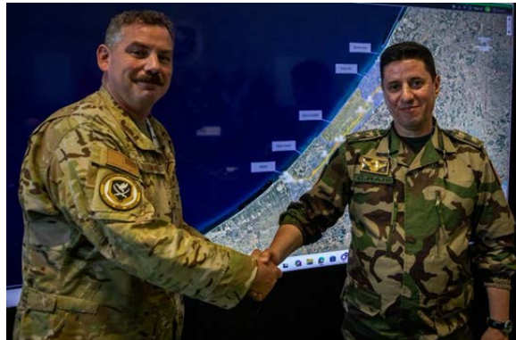
The arrival of representatives of the Moroccan army who will participate in the international stabilization force (Board of Peace X account, June 23, 2026)

Kerem Shalom and not be stationed at international stabilization force bases inside the Strip (Ynet, June 18, 2026).