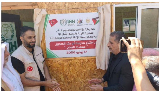
School inauguration

► The Hamas ministry of interior and national security issued a statement for the beginning of the matriculation examinations, which are being held "under exceptional conditions due to the war." The ministry wished the students success and called on the public to show social responsibility, maintain quiet and avoid noise and disturbances to allow students to take their examinations in a calm atmosphere. It added that the ministry's agencies were monitoring the situation and being supportive in accordance with the circumstances (Palestinian Police Telegram channel, June 20, 2026).