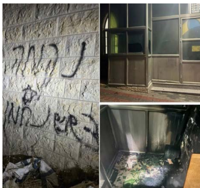
The mosque fire (Wafa, June 17, 2026)

► Hamas figure Mahmoud Mardawi praised the residents of Turmus Ayya, Sa'ir and Khallat al-Hams south of Hebron for standing up to attacks by Jewish rioters and holding Friday prayers on land designated for confiscation. He called for expanding "popular activity" on the ground, strengthening defense committees and supporting residents and farmers, claiming that attachment to the land and "popular resistance" were the way to stop settlement, annexation and displacement (Hamas official Telegram channel, June 19, 2026).