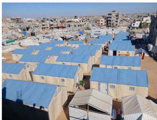
The new reception center in the northern Gaza Strip (Facebook page of the Palestinian Authority ministry of public works and housing, June 20, 2026)

► Ahed Bseiso, Palestinian Authority minister of public works and housing, announced the launch of a program for the reconstruction and repair of homes which were partially damaged in the Gaza Strip, part of efforts to return residents to their homes. He said the ministry was repairing homes using materials available in local markets in light of the shortage of construction materials in the Strip. He noted that the ministry had repaired 300 housing units in cooperation with the Beit Lahia development association and was working on an additional 125 units. He added that the ministry had established 15 shelter camps housing approximately 1,700 families and was constructing eight additional camps (Facebook page of the Palestinian Authority ministry of public works and housing, June 20, 2026).