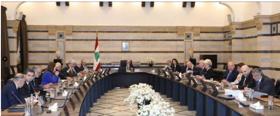
Lebanese cabinet meeting (Lebanese prime minister's X account, June 15, 2026)

► At the opening of a cabinet meeting Prime Minister Salam stated that since "the beginning of the war imposed on Lebanon, the Lebanese government has never ceased working to end it." He said he hoped the ceasefire declaration between the United States and Iran would end the war and halt the "killing, destruction, displacement, suffering and pain inflicted upon the Lebanese." He said Lebanon would intensify its efforts through the negotiations taking place in Washington to secure "a complete Israeli withdrawal and the release of the prisoners" (Lebanese presidency X account, June 15, 2026).