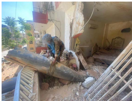
A Lebanese army bomb-disposal expert neutralizes an unexploded bomb (Lebanese army X account, June 16, 2026)