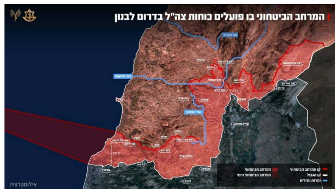
Right: The area of IDF operations in south Lebanon (IDF spokesperson, June 18, 2026).