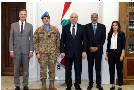
Aoun with the UNIFIL commander (Lebanese presidency X account, June 17, 2026)

► Lebanese President Joseph Aoun met with UNIFIL Commander General Diodato Abagnara and the acting United Nations special coordinator for Lebanon, Imran Riza. They discussed the situation in south Lebanon and UNIFIL's activities in light of the difficulties facing its movements within the area of operations. They also discussed the period following the expiration of the UN force's mandate in south Lebanon. Aoun again expressed his condolences for the deaths of members of the multinational force in the south and praised their sacrifice for peace in Lebanon (Lebanese presidency X account, June 17, 2026).