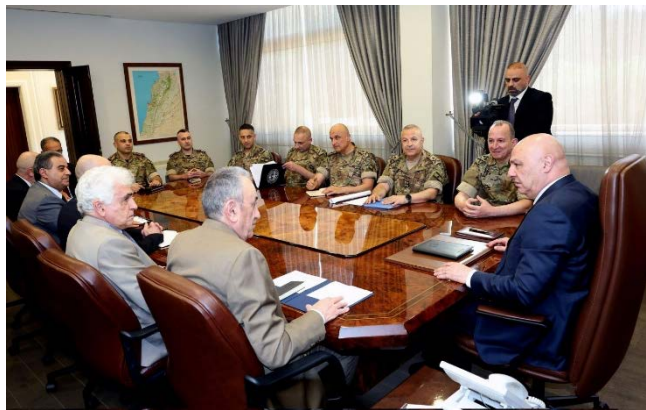
President of Lebanon meets with the army commander and the negotiating team