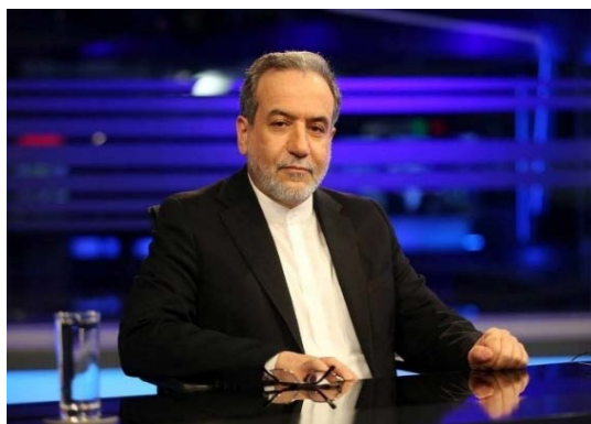
The Iranian foreign minister (snn.ir, June 12, 2026)