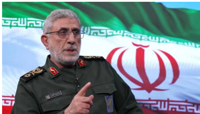
The commander of the Qods Force

◆ Consequences of the campaign: Qaani expressed his confidence that the war accelerated the beginning of the decline of the United States and that the collapse of the “Zionist regime” is now approaching at a faster pace.