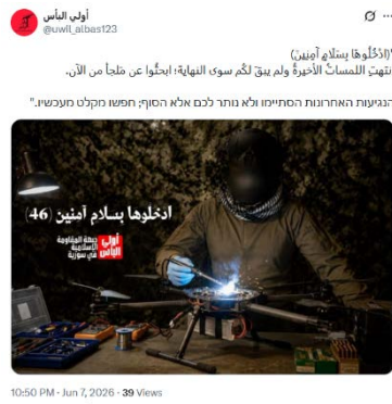
Poster issued by the militia (Islamic Resistance Front X account, June 7, 2026)