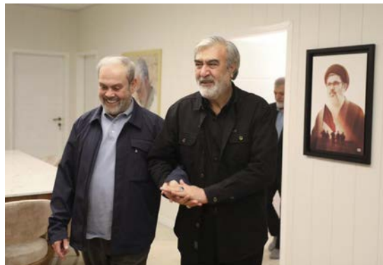
Ebrahim Azizi and Abdallah Safieddine (Azizi’s X account, June 5, 2026)

► Ebrahim Azizi, chairman of the Majles National Security and Foreign Policy Committee, met with Hezbollah’s representative in Iran, Abdallah Safieddine. In a statement published by Azizi, he noted that he emphasized to the Hezbollah representative that the struggle of the “Resistance Front” will continue until the shameful withdrawal of the “Zionist regime,” and that the United States will have no choice but to surrender to the will of the Iranian people and the brave “Resistance Front” (Ebrahim Azizi’s X account, June 5, 2026).