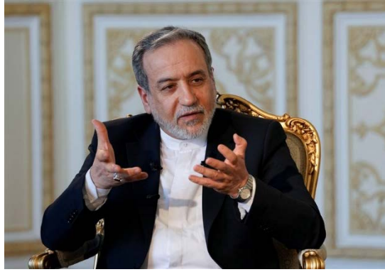
The Iranian Foreign Minister (Al-Mayadeen, June 3, 2026)