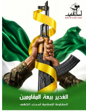
Poster by Ashab al-Kahf against giving up weapons (Ashab al-Kahf Telegram channel, June 3, 2026)