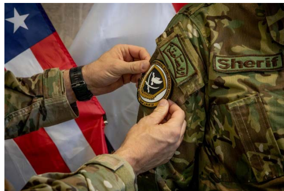
Egypt joins the international stabilization force (X account of the Board of Peace, June 4, 2026)