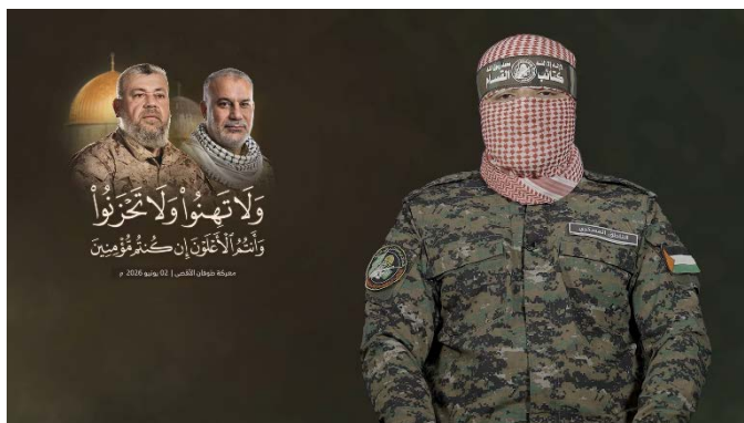
Abu Obeida in a speech commemorating the leaders of the military wing who had been eliminated (Abu Obeida's Telegram channel, June 3, 2026)

► Abu Obeida, spokesman for the Hamas military wing, said eliminating the Izz al-Din al-Qassam Brigades' leaders would not weaken it and "the blood of the shaheeds helps overcome difficulties." He warned that "the blood account" would remain open until the occupation settled it, adding that the military wing still had commanders who "grew up in the field and were shaped by experience and wars" (Abu Obeida's Telegram channel, June 3, 2026).