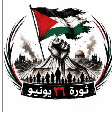
The logo of the June 26 Revolution (June 26 Revolution Facebook page, June 8, 2026)

Board of Peace, on June 26 and claimed Abd al-Aati was working in the service of Israel and the United States (Ahl al-Sitr Facebook page, June 8-9, 2026).