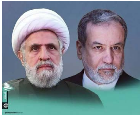
The Iranian foreign minister and the secretary-general of Hezbollah (Al-Mayadeen, May 23, 2026)

▶ Iranian Foreign Minister Abbas Araghchi emphasized in a message to Hezbollah Secretary-General Naim Qassem that the Islamic Republic will not cease its support for “justice- and freedom-seeking” movements, primarily Hezbollah, until the very last moment. Araghchi added that Iran has set a ceasefire in Lebanon as a condition for any agreement with the United States, and that the recent Iranian proposal for ending the war, submitted through Pakistan, once again emphasized that Lebanon must be included in the ceasefire agreement (Al-Mayadeen, May 23, 2026).