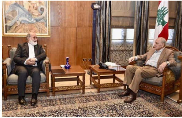
Meeting between the chargé d'affaires of the Iranian Embassy and the speaker of the Lebanese Parliament