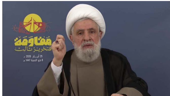
Qassem gives his speech (al-Manar, May 24, 2026)

how he could logically be a partner and representative in a government he accused of treason and conspiracy against its people ( Nidaa al-Watan , May 25, 2026).