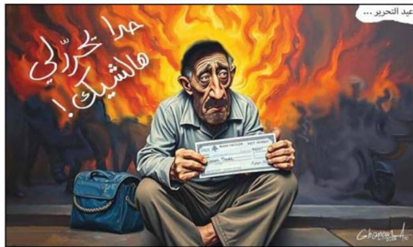
A Lebanese has returned home and holds a check, but the money does him no good because everything has gone up in flames ( al-Joumhouria , May 25, 2026)

► According to reports, Lebanese were gradually returning to the Dahiyeh al-Janoubia in Beirut after months of displacement, but mainly because of economic constraints and not because of a real sense of security. Reportedly, many business owners and local residents returned to the area to renew their sources of livelihood and gradually restore the routine of life, but at the same time said they were concerned about renewed escalation and maintaining alternative housing options outside the area. In addition, some educational institutions have not yet returned to full activity and many businesses continue only limited operations ( al-Sharq al-Awsat , May 20, 2026).